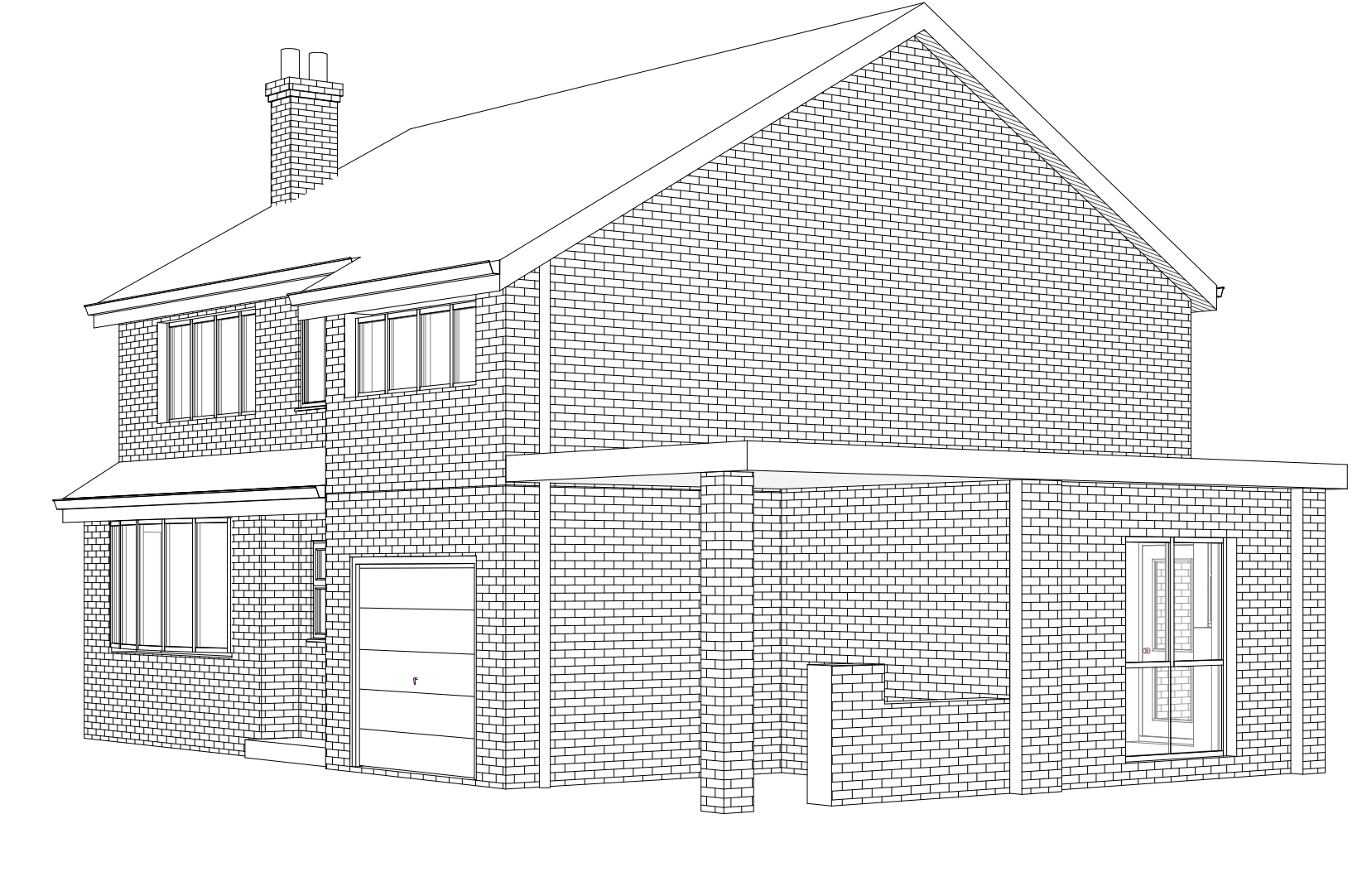
3D View 2