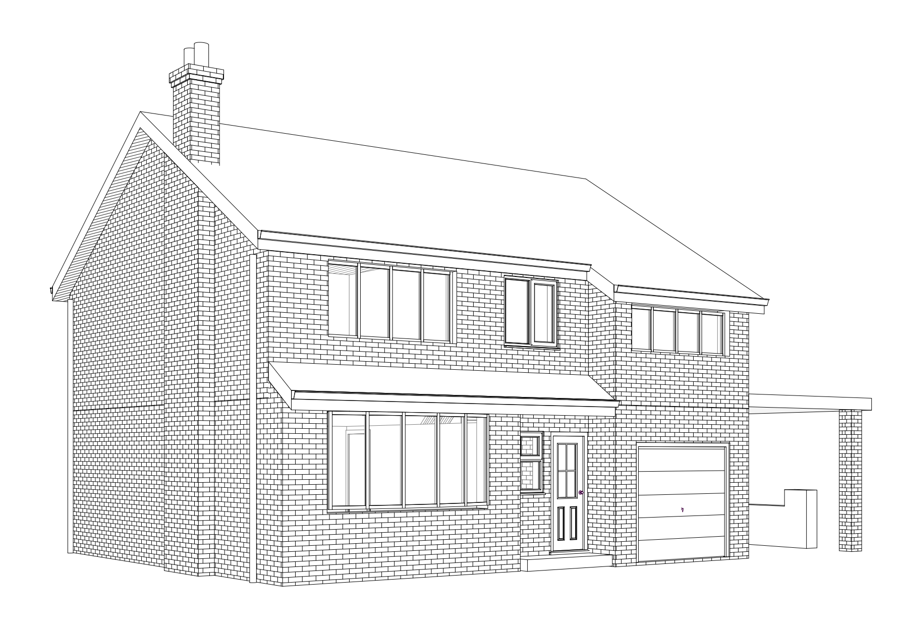
3D View 1