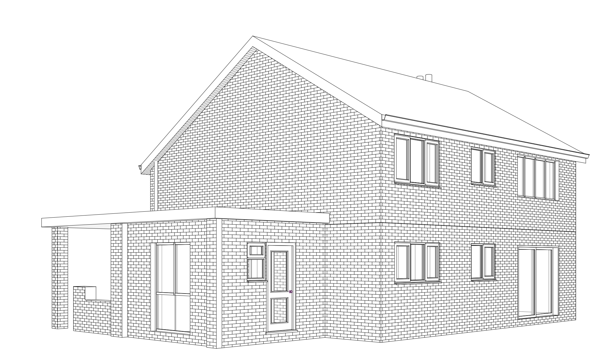
3D View 3