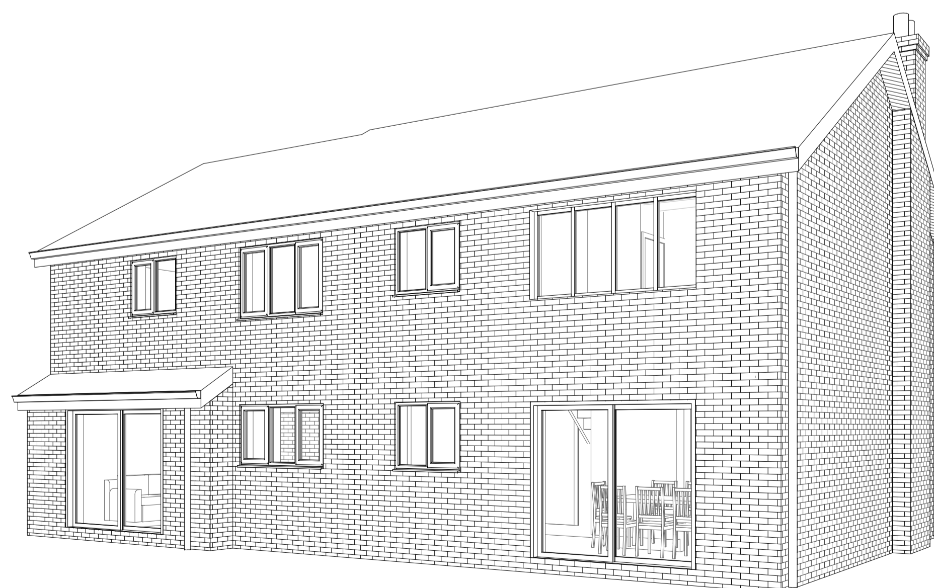
3D View 4