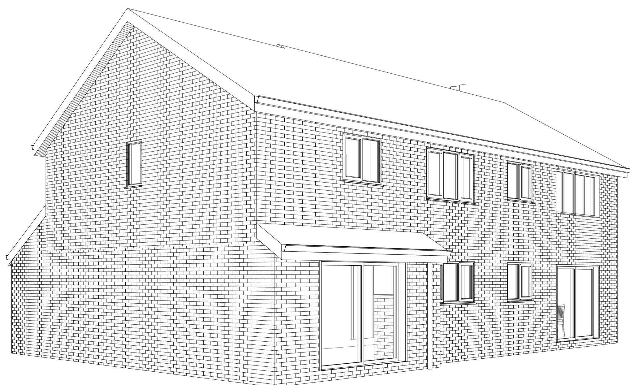
3D View 3