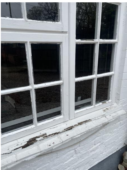
Outside lounge window