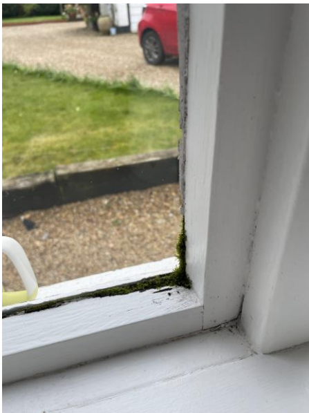
Inside kitchen window (moss and mould growth)

Photos showing existing poor state of timber windows: