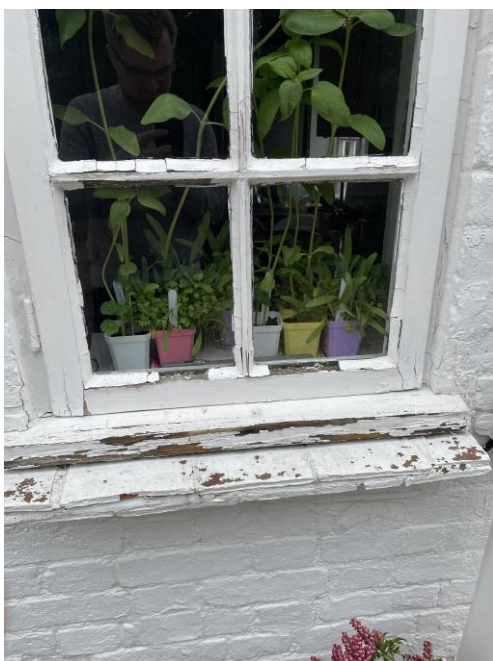
Outside kitchen window