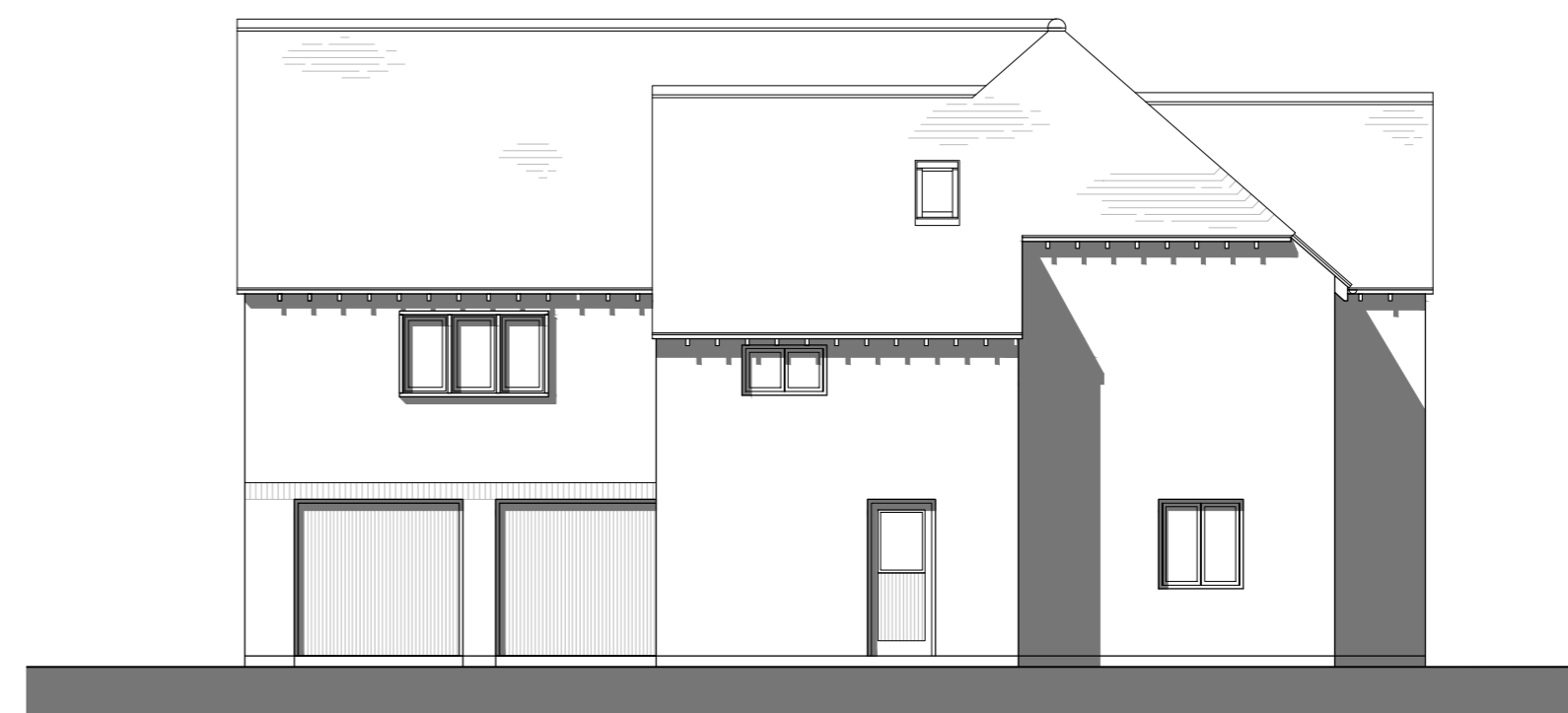
SIDE (NORTH) ELEVATION