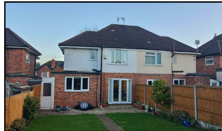
REAR ELEVATION PHOTOGRAPH