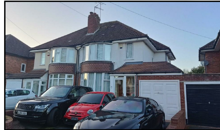
FRONT ELEVATION PHOTOGRAPH