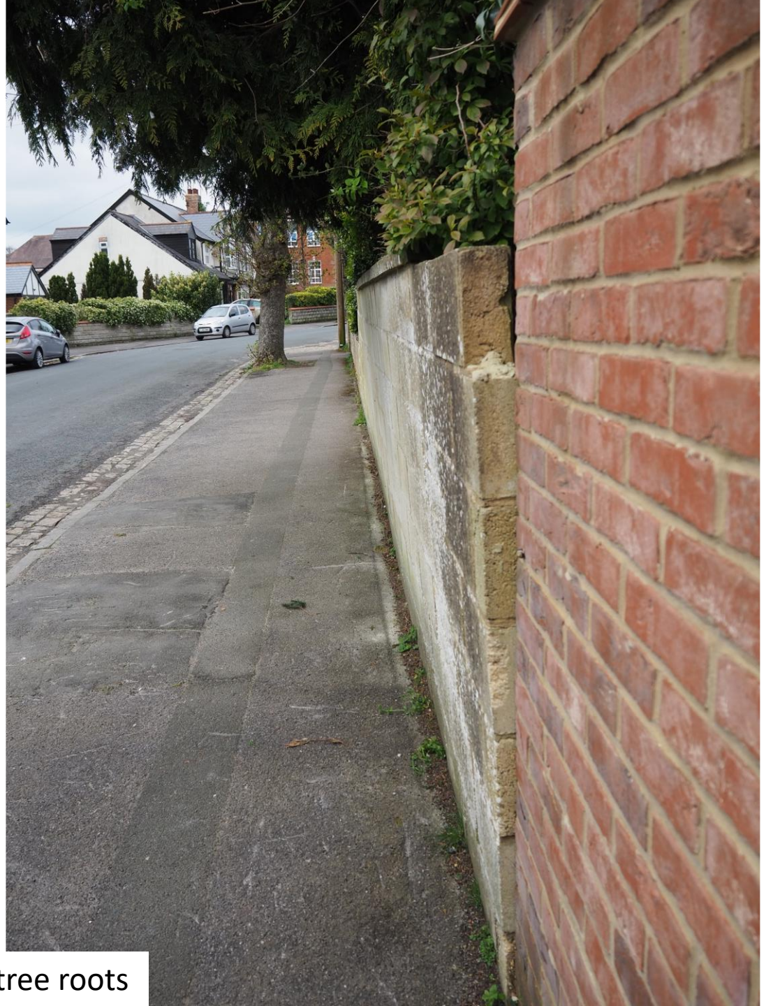
Figure 3 Displacement of wall from tree roots

Bulging out of 111 wall aligns with roots of Large Tree 1 (cedar ?) and Tree 2 shown on Figure 2. Note branches overhang the pavement