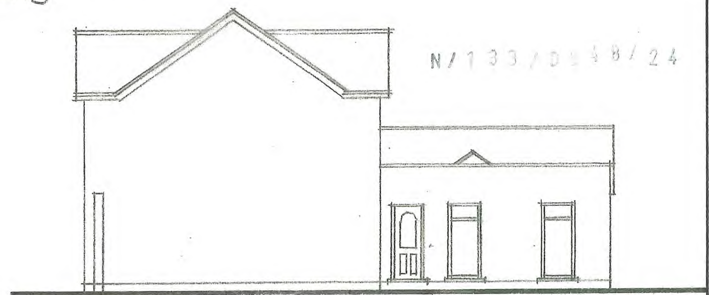
existing side elevation