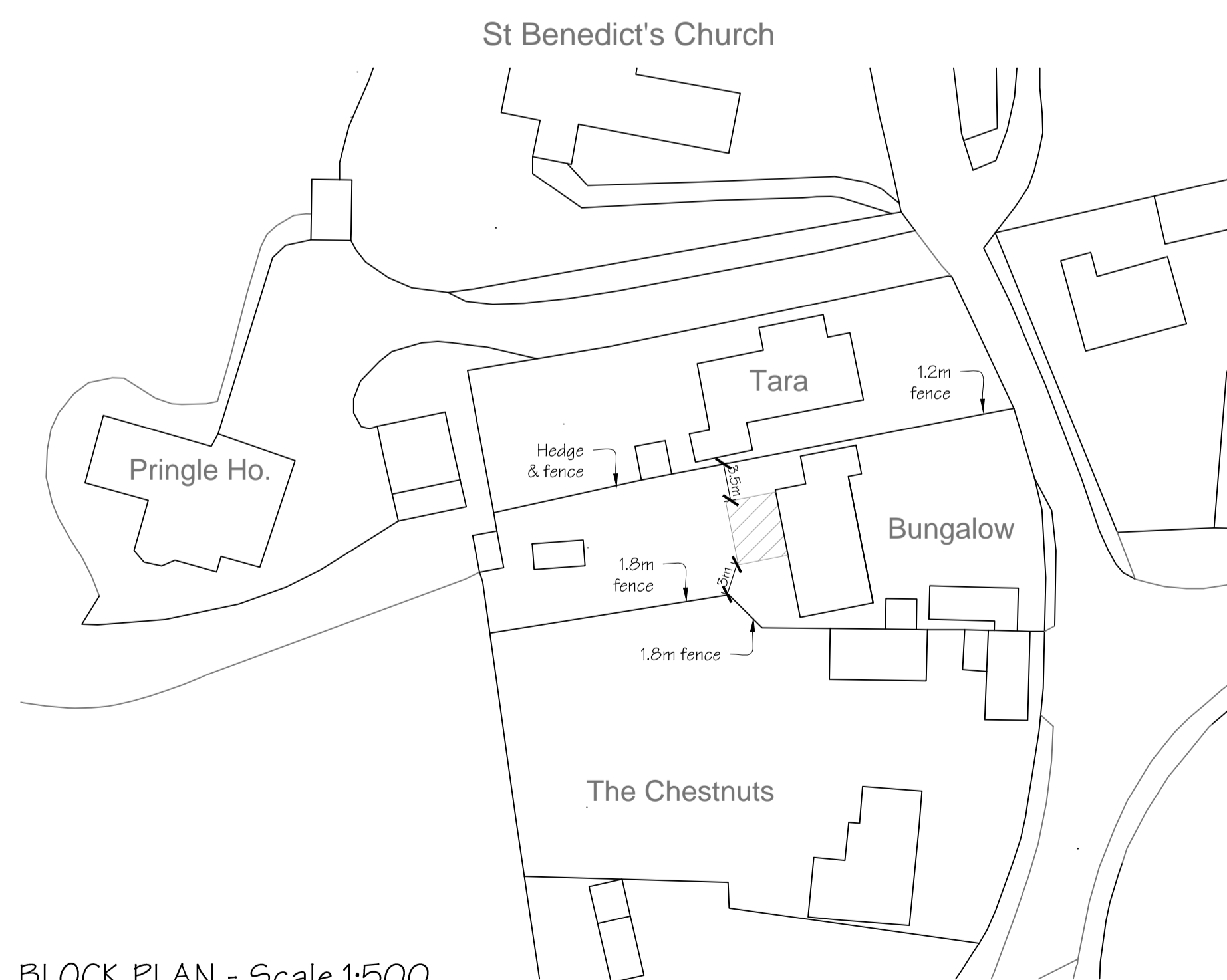
BLOCK PLAN - Scale 1:500