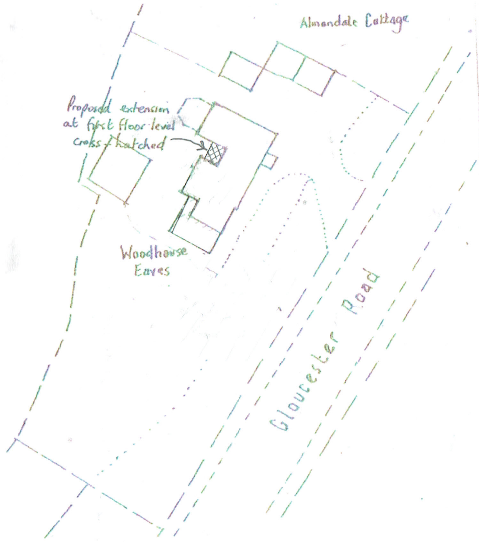
PROPOSED SITE PLAN 1:500