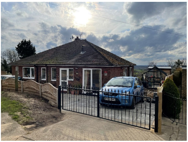
Shared Driveway Access from Staples Lane