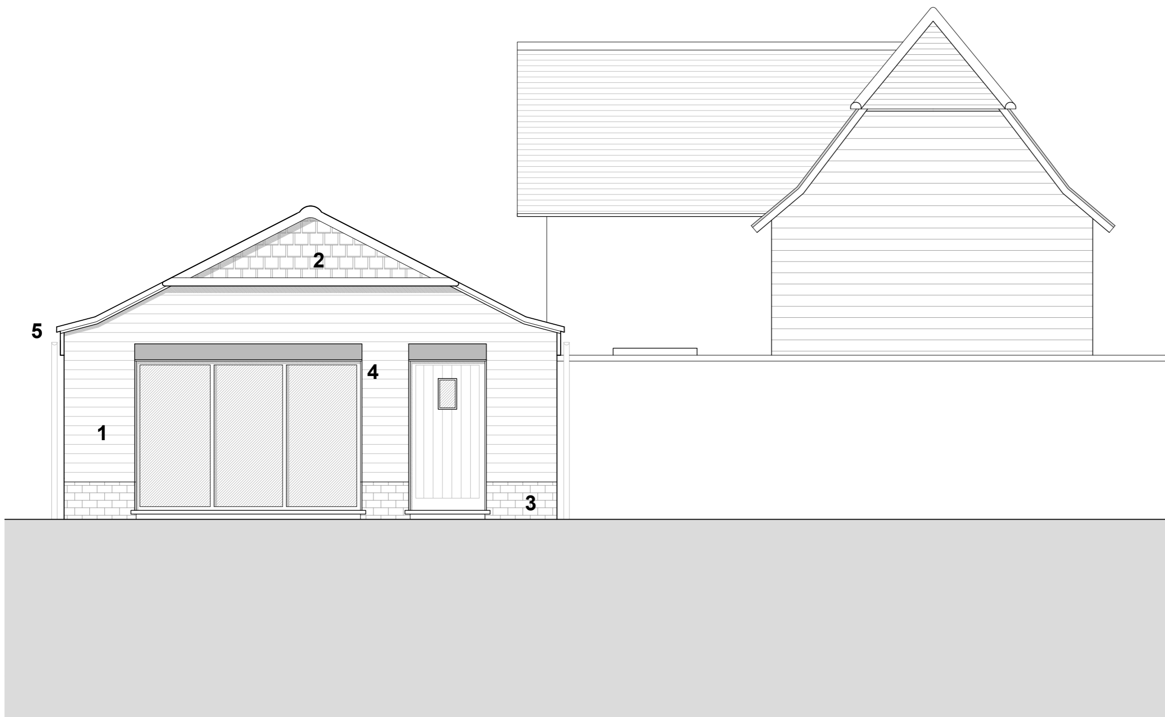
Proposed North Elevation: Barn 3 | 1:50