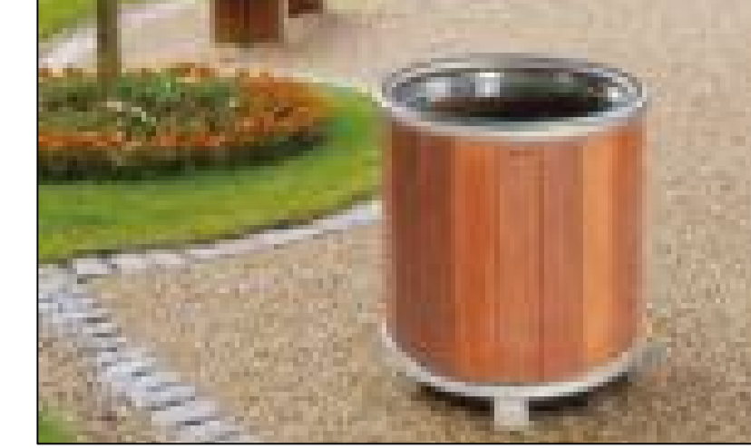
Excel Litter Bin by Woodscape