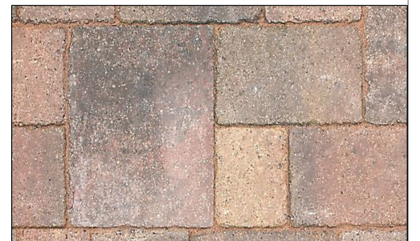
Marshalls Tegula Paving and Charcoal on driveways