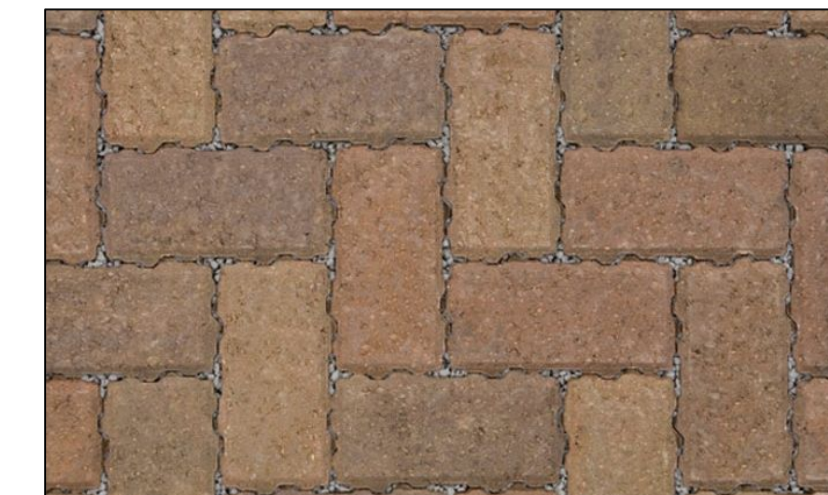
Marshalls Keyblok in Bracken and laid herringbone.