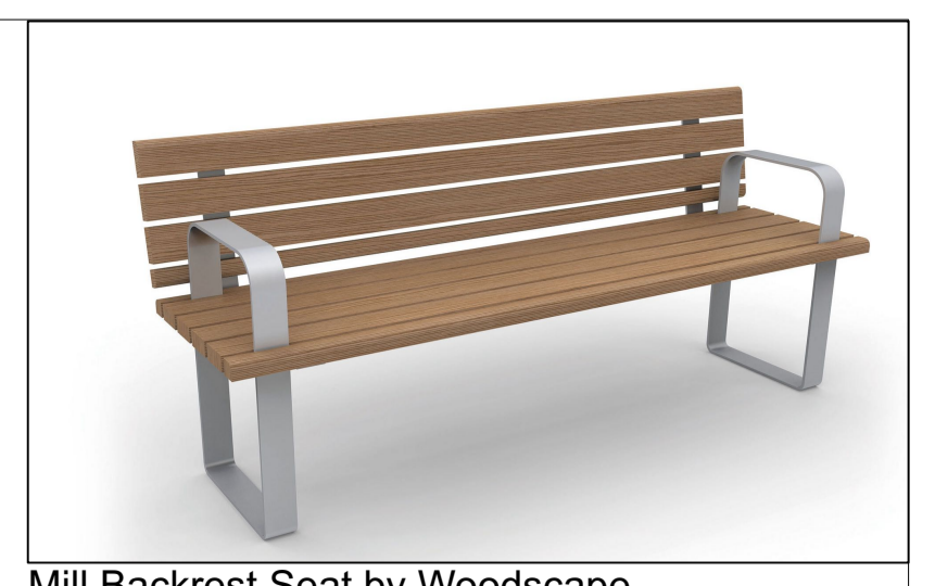
Mill Backrest Seat by Woodscape