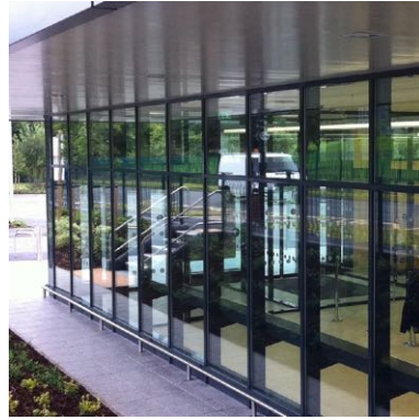
1 Shopfronts / window frames - polyester powder coated aluminium, colour - dark grey ral 7016 (anthracite) by Senior Architectural Systems