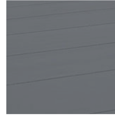
5 Roof - Kingspan KS 1000TD (Topdek) composite roof panels. Anthracite grey RAL 7016