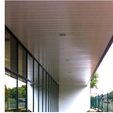
4 External soffit planks to cantilvered canopy, 150mm wide ash plank white soffit planks, colour white, from Ash and Lacy