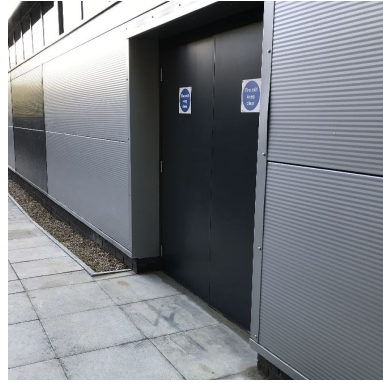
3 External escape doors and frames, steel polyester powder coated finish, colour - dark grey ral 7016 (anthracite)