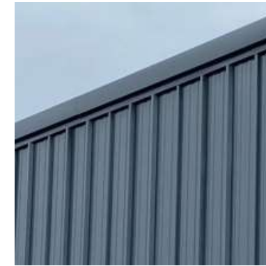
10 Fascia dark grey ral 7016 (anthracite)