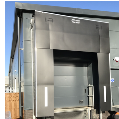
9 Sectional overhead loading bay door - pvf coated steel, ral 7016 (anthracite). Curtain Dock Shelter, colour black