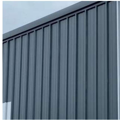
6 Wall - Kingspan KS1000RW anthracite grey cladding RAL 7016