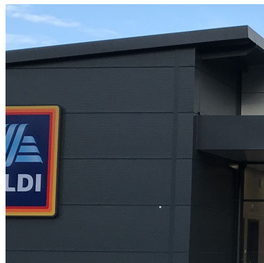
13 Wall - Kingspan KS1000MR anthracite grey cladding RAL 7016