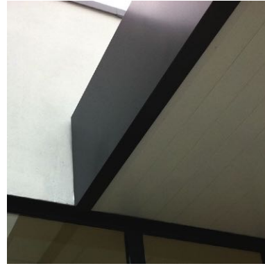
2 Canopy cladding - polyester powder coated aluminium, colour - dark grey ral 7016 (anthracite)