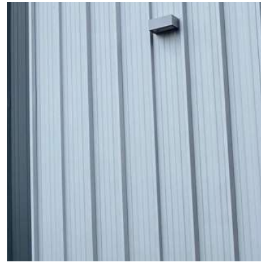
7 Wall - Kingspan KS1000RW metallic silver cladding RAL 9006