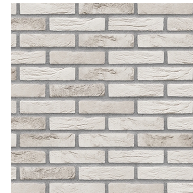
15 Wall - Facing brick masonry wall. Colour, light grey multi.

FOR LOCATION OF MATERIALS SHOWN ABOVE PLEASE REFER TO PROPOSED ELEVATIONS 200413-1400 AND ROOF PLAN 200413-1360