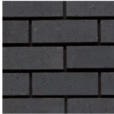
8 Blockleys brick Ltd. 'smooth black' with tarmac y14 (black) coloured mortar brickwork to building plinth