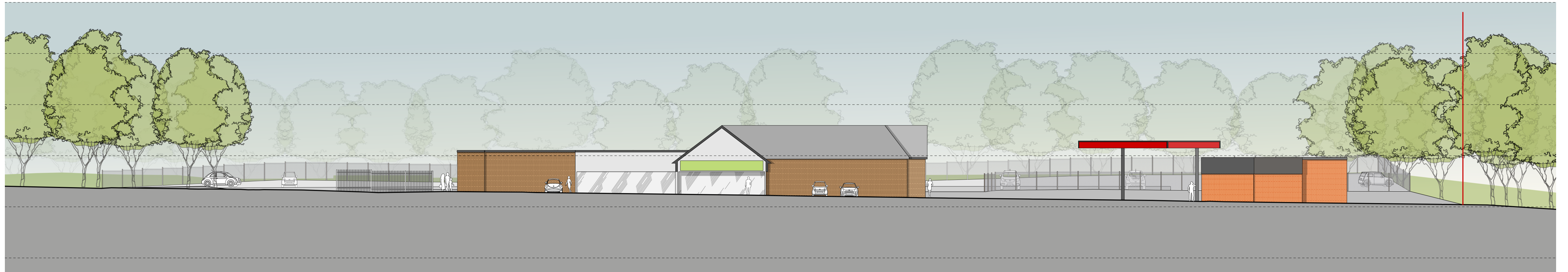
EXISTING SITE SECTION (A - A)