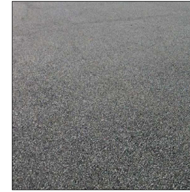
5 Tarmac beneath Aldi canopy to entrance area, trolley bay and public realm