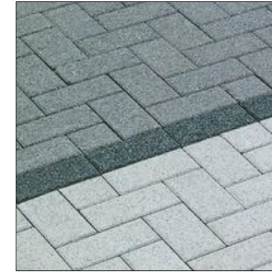
9 Concrete block paving laid in a herringbone pattern to parking bays

FOR LOCATION OF MATERIALS SHOWN ABOVE PLEASE REFER TO PROPOSED SITE PLAN DRAWING NUMBER 200413-1300