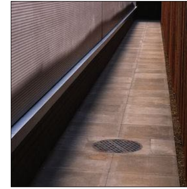
4 600 x 600mm concrete paving slabs to rear of store for maintenance / escape route. Colour: Grey