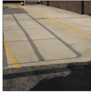
3 Concrete surface to loading bay ramp, brushed finish.