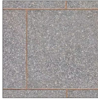
7 450 x 450mm Marshalls conesevation paving around store entrance. Smooth finish, colour charcoal