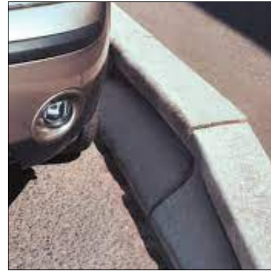
8 Concrete trief kerbs