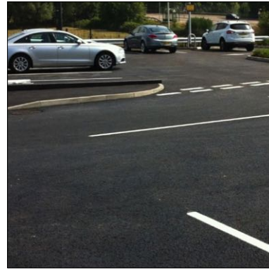
2 Tarmac car park area