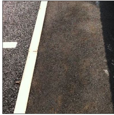
1 Tarmac path with concrete kerb edging - Car park area