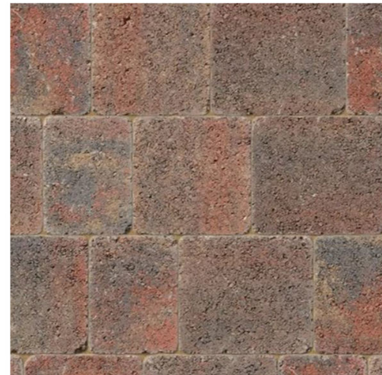
Above: Manufacturers data.