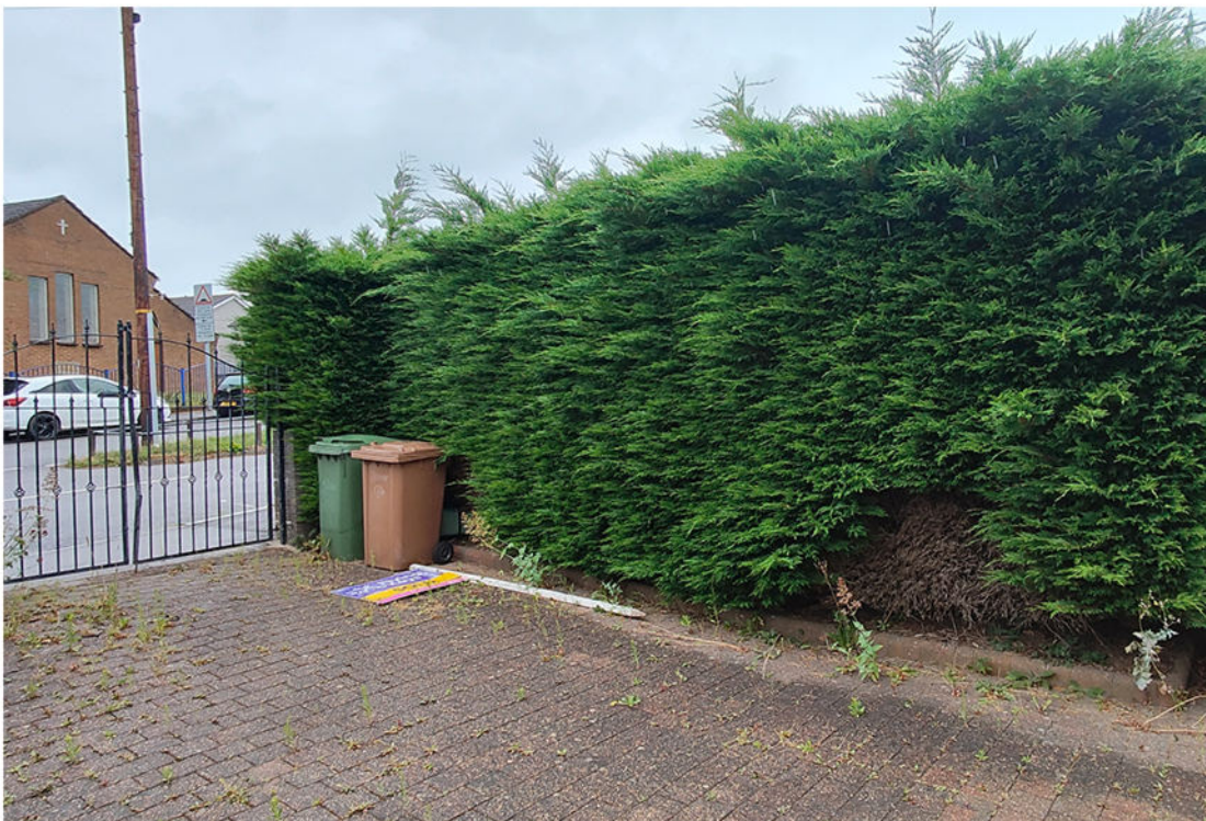
Right: Existing driveway material.