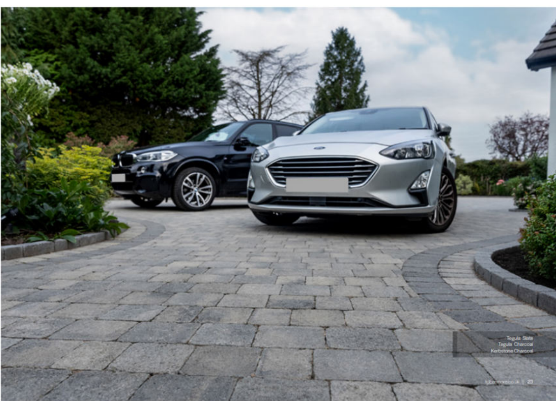
Tegula Slate Tegula Charcoal Kerbstone Charcoal