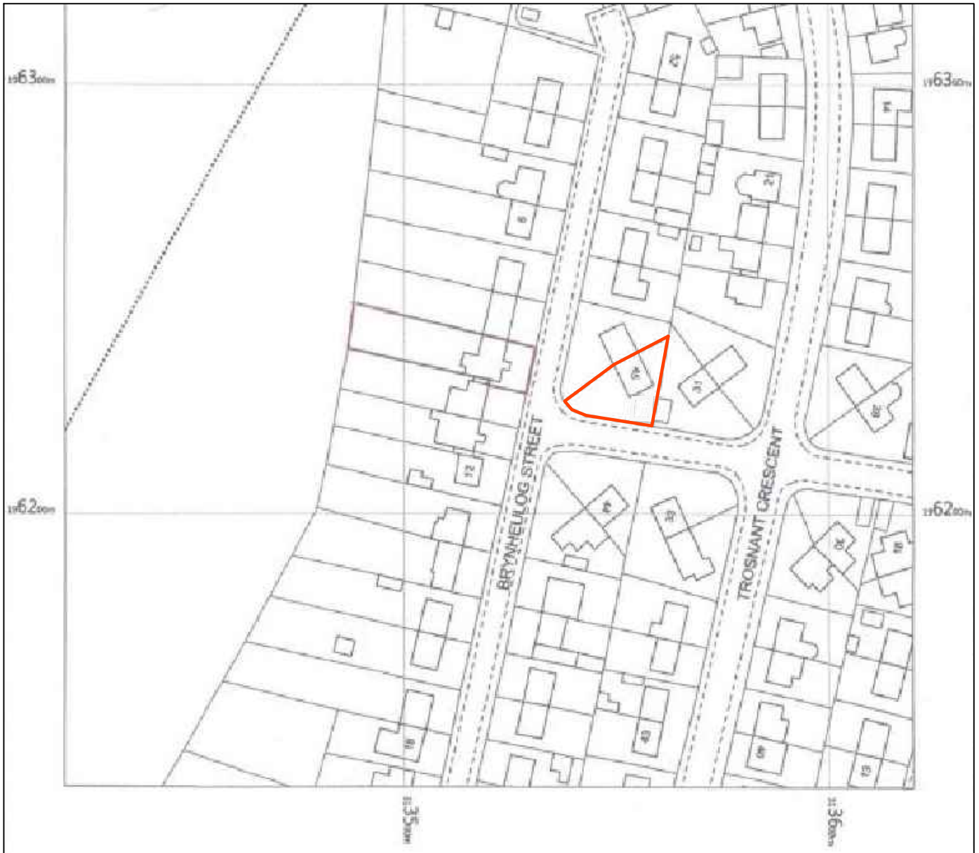
LOCATION PLAN (SCALE 1:1250)