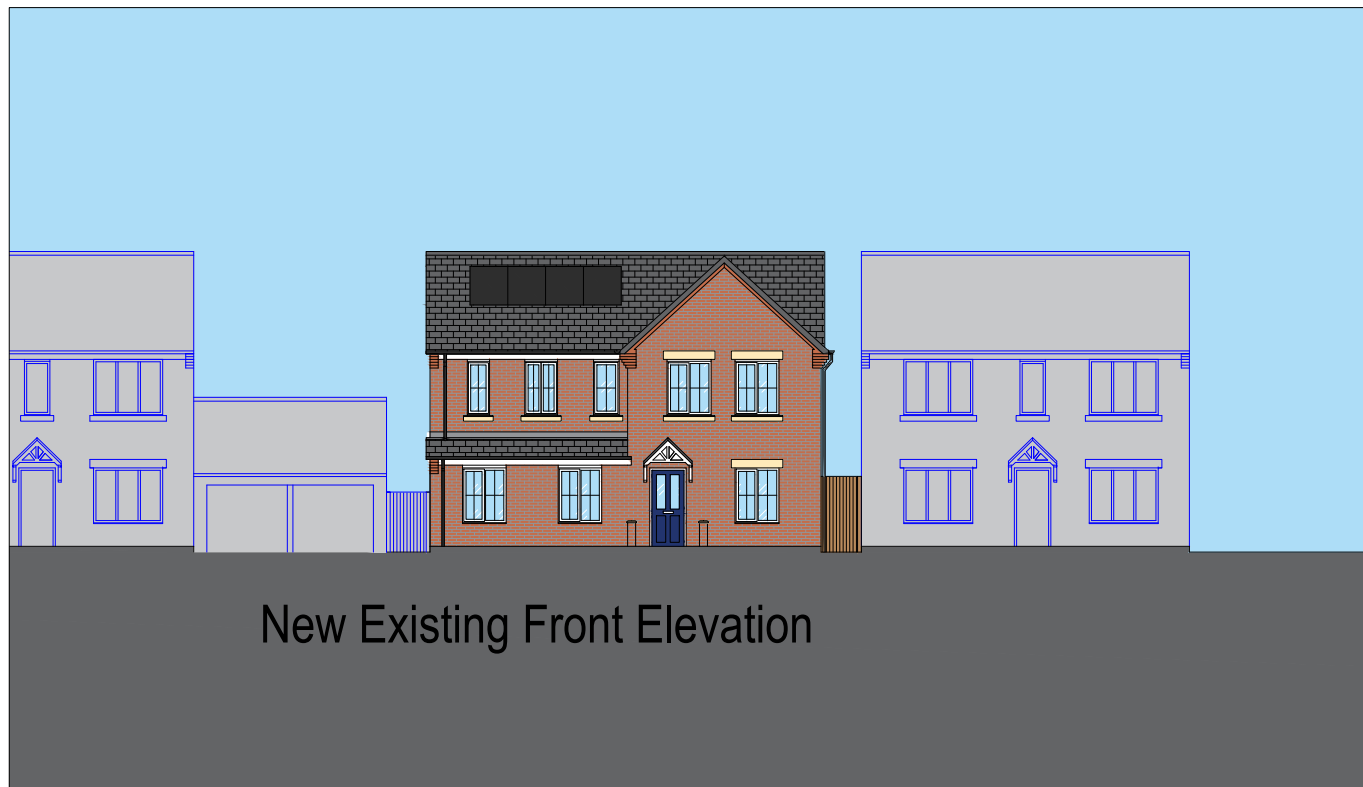
Scale 1:200 @ A4