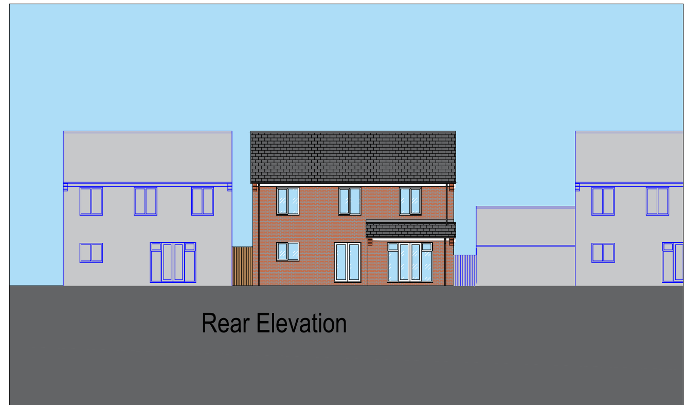
Scale 1:200 @ A4

28 Whinfell Close, Chorley PR25 5AL Existing and New Site Plan, Floor Plan and Elevations