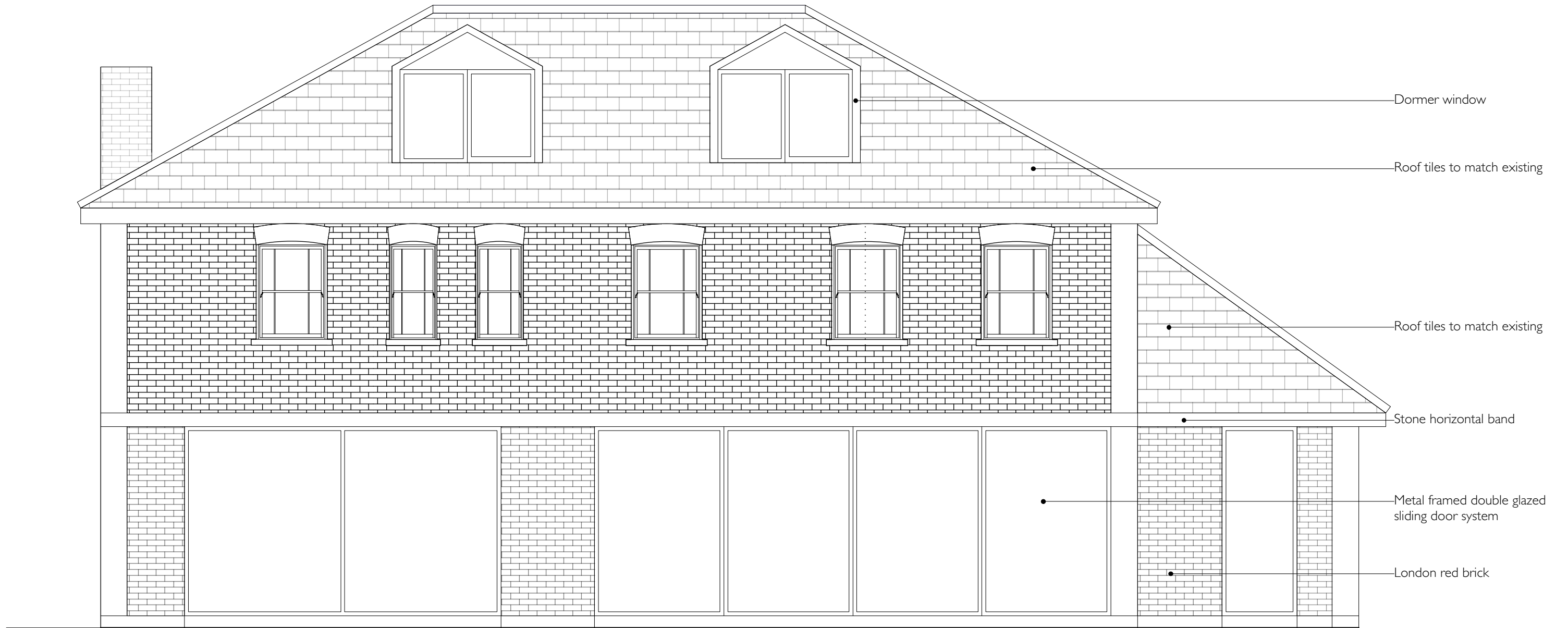
1 Proposed Rear Elevation Scale: 1:50