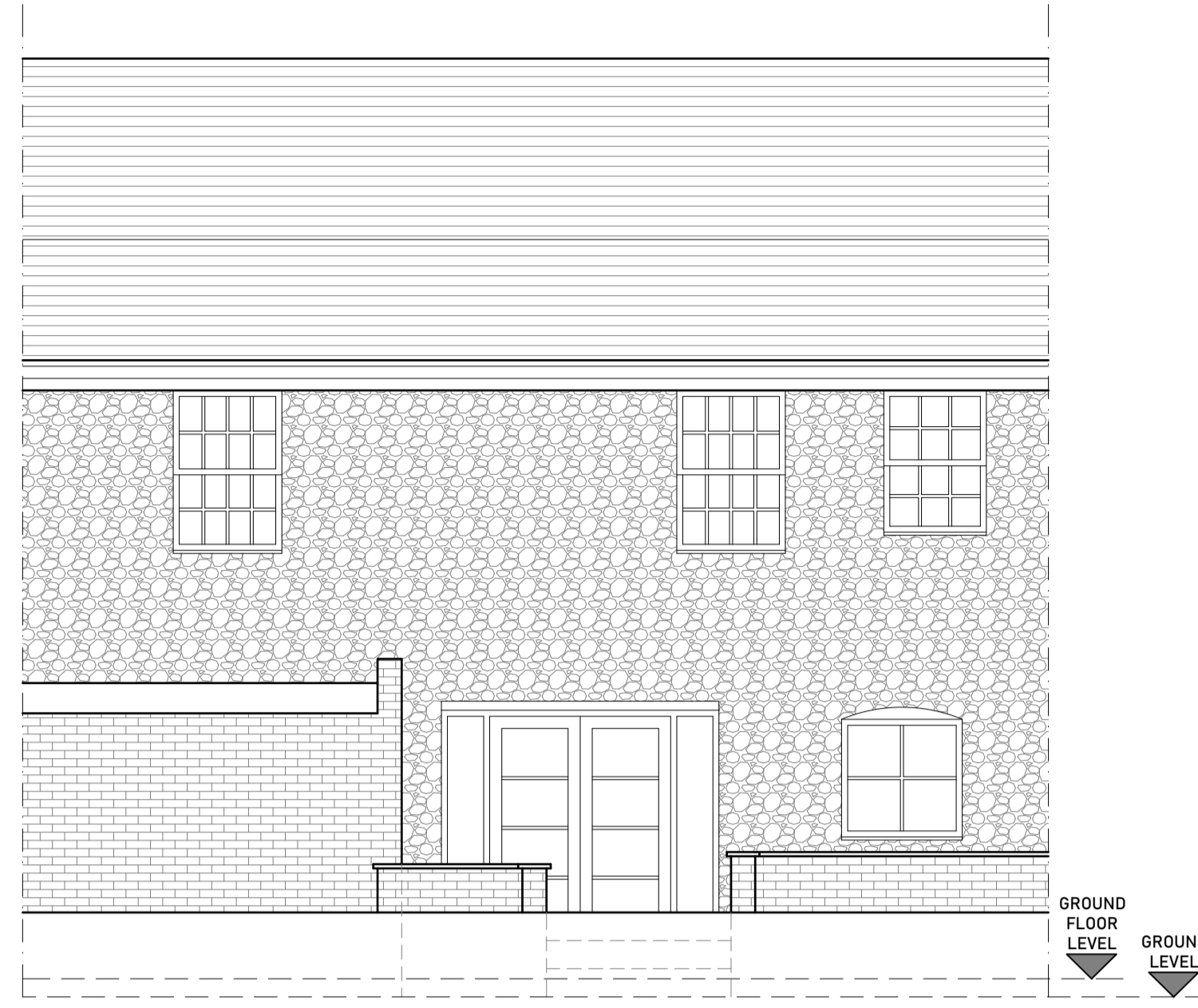
EXISTING REAR ELEVATION WITH GARDEN 1:50