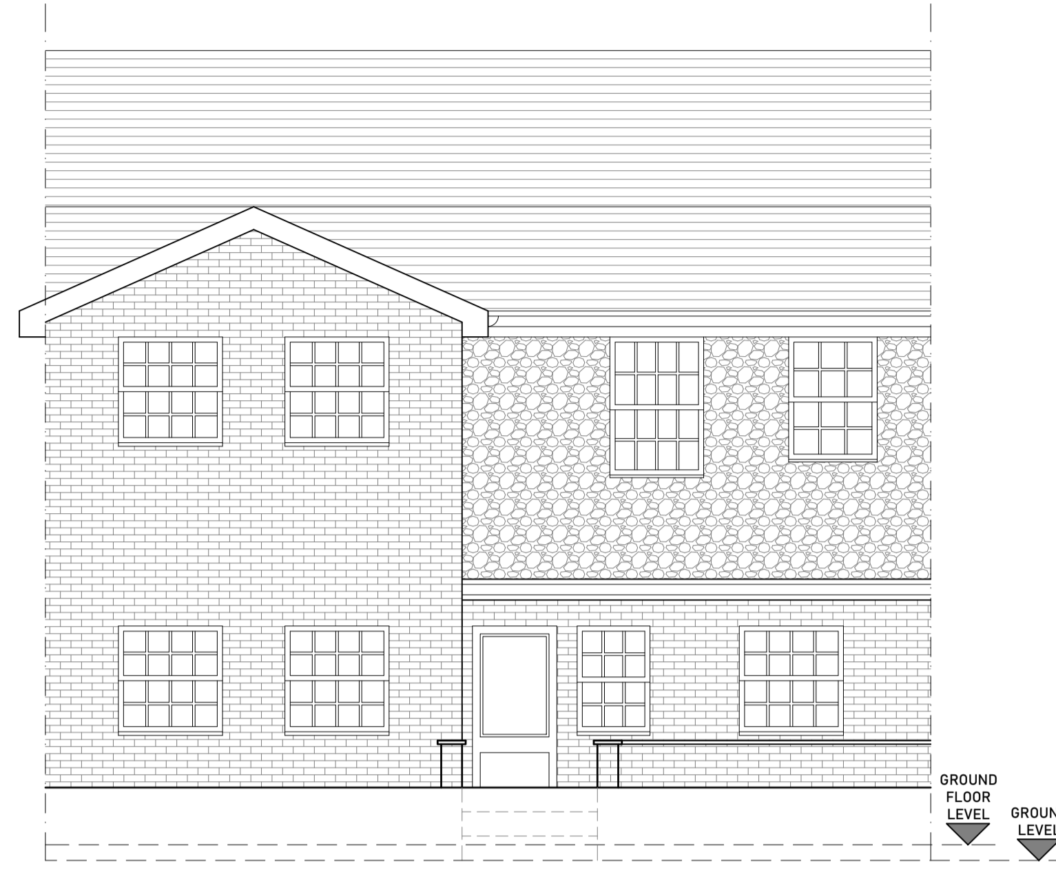
PROPOSED REAR ELEVATION WITH GARDEN 1:50