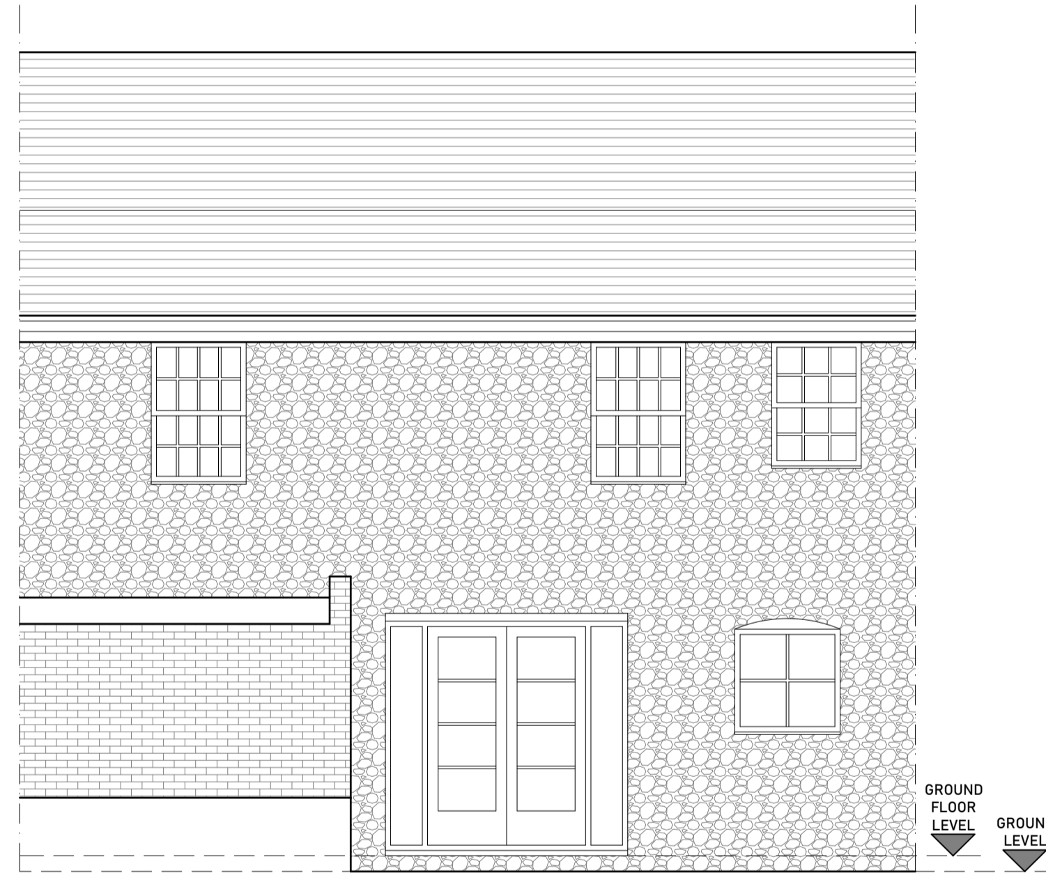
EXISTING REAR ELEVATION 1:50