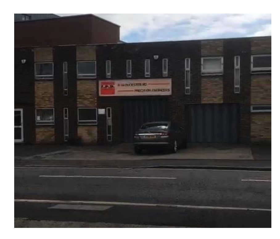
VIEW FROM GLOUCESTER ROAD SHOWING NEIGHBOURING BUSINESS UNIT