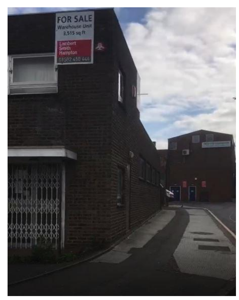
VIEW FROM BOLTON ROAD SHOWING 2 GLOUCESTER ROAD BUSINESS UNIT