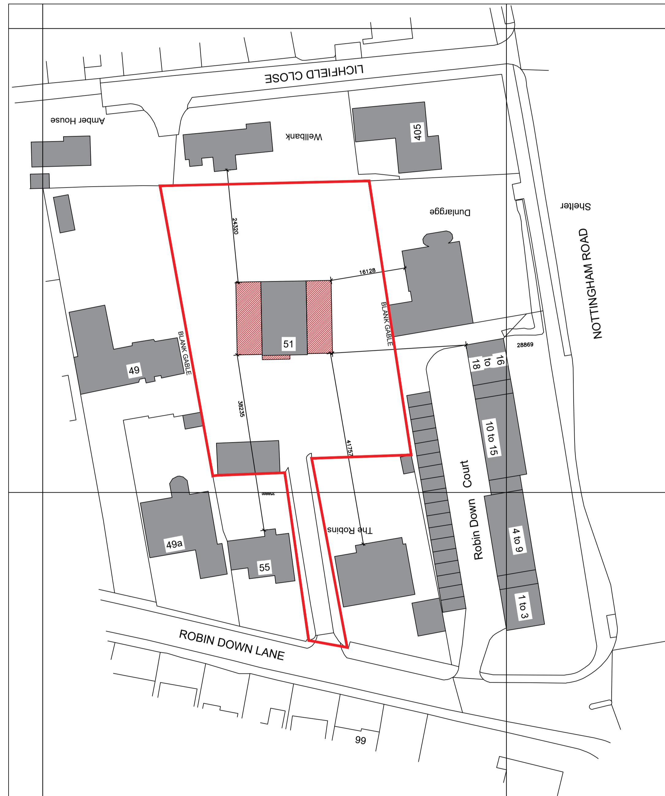
BLOCK PLAN AS PROPOSED 1:50

Worcester architects are appointed as 'Designer only, unless a written appointment has been completed for the formal appointment as 'Principal Designer'