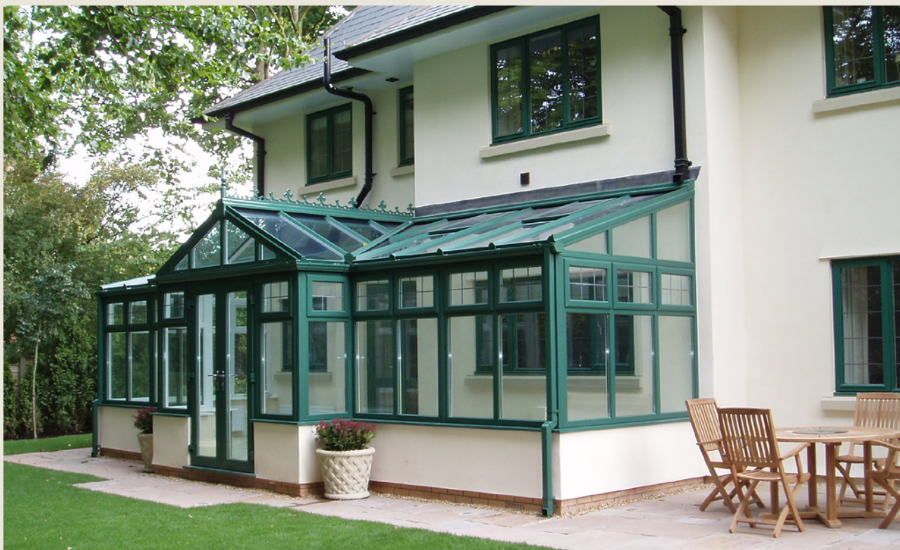
Why not choose white on the inside and a colour on the outside?

Whatever colour you choose, you can rest assured that your new frames come with all the quality, energy-efficiency, guarantees and low maintenance benefits you would expect from your local Network VEKA member.