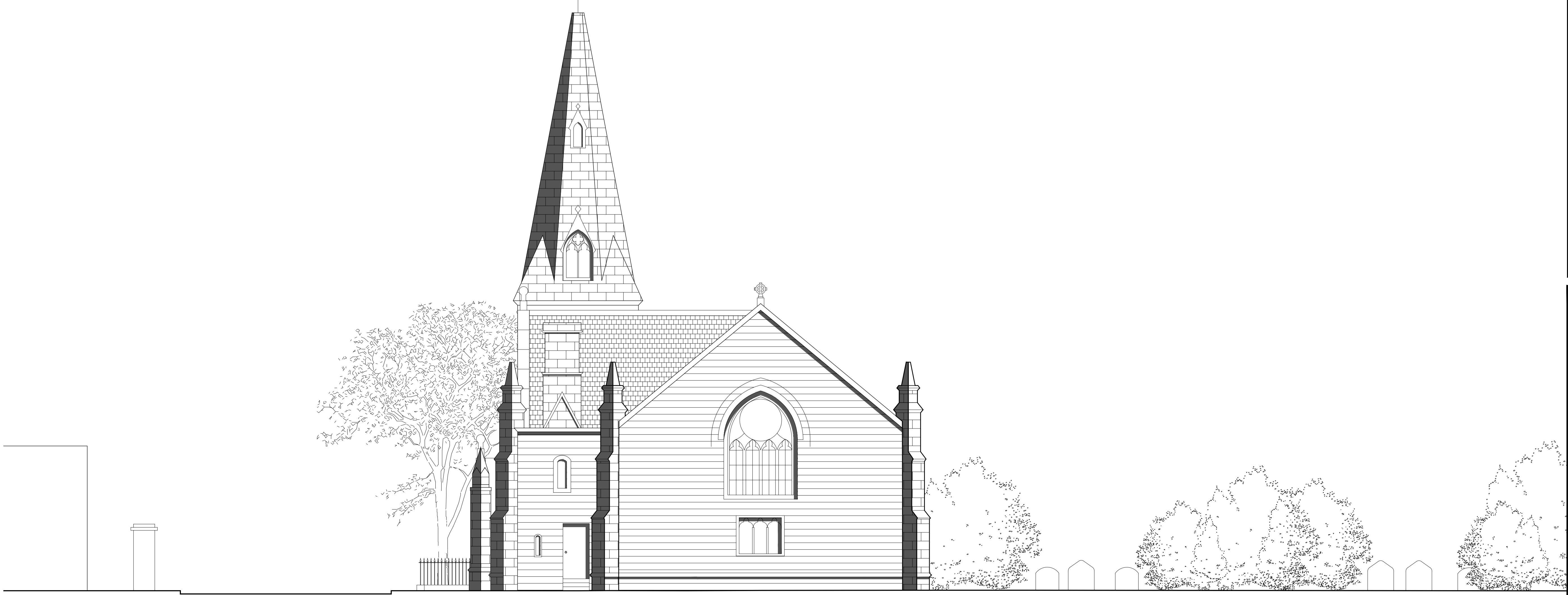
EXISTING ELEVATION B SCALE 1:100 @ A1