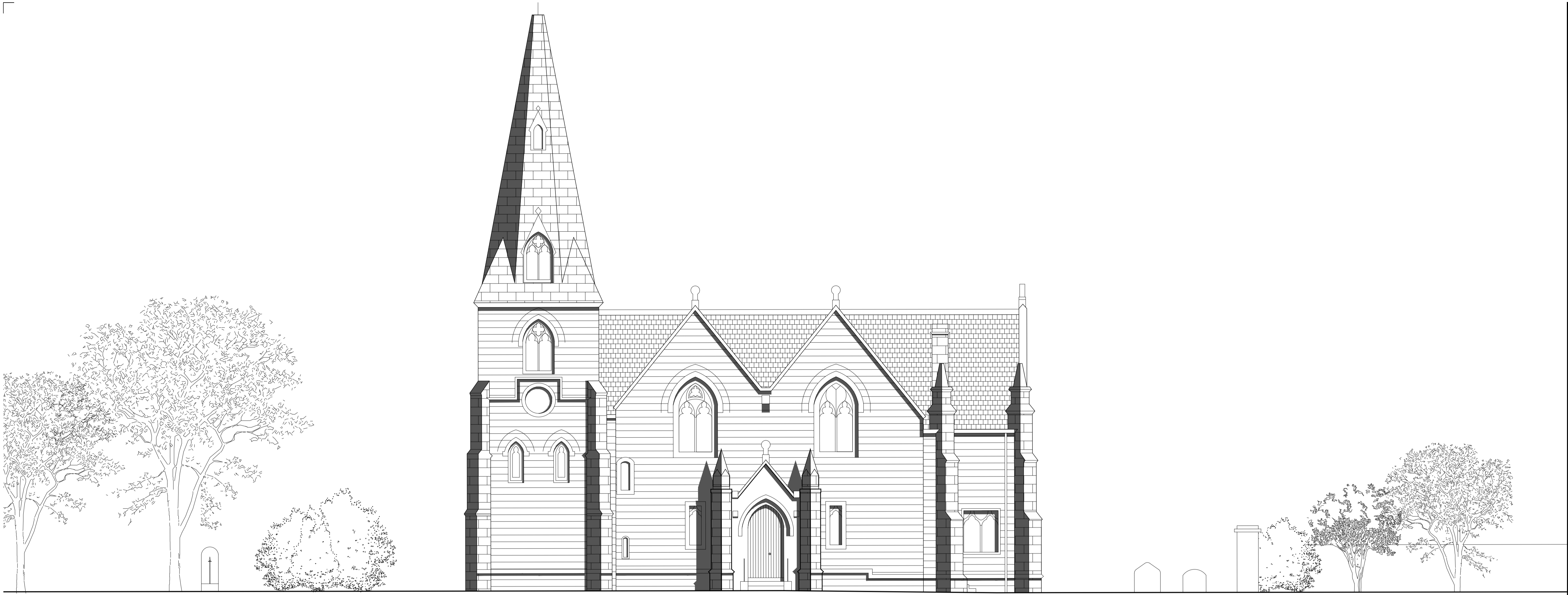
EXISTING ELEVATION A SCALE 1:100 @ A1