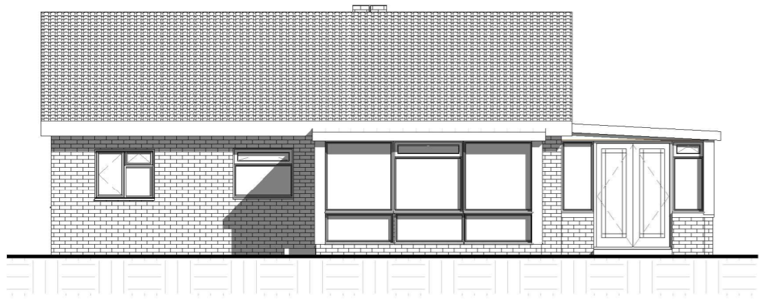
1 North West Elevation 1 : 100