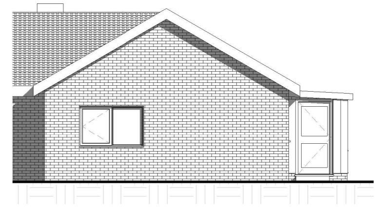
3 North East Elevation 1 : 100