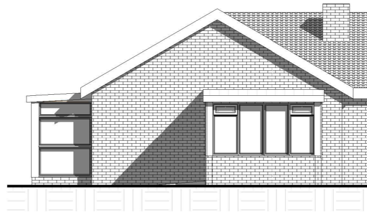
2 South West Elevation 1 : 100