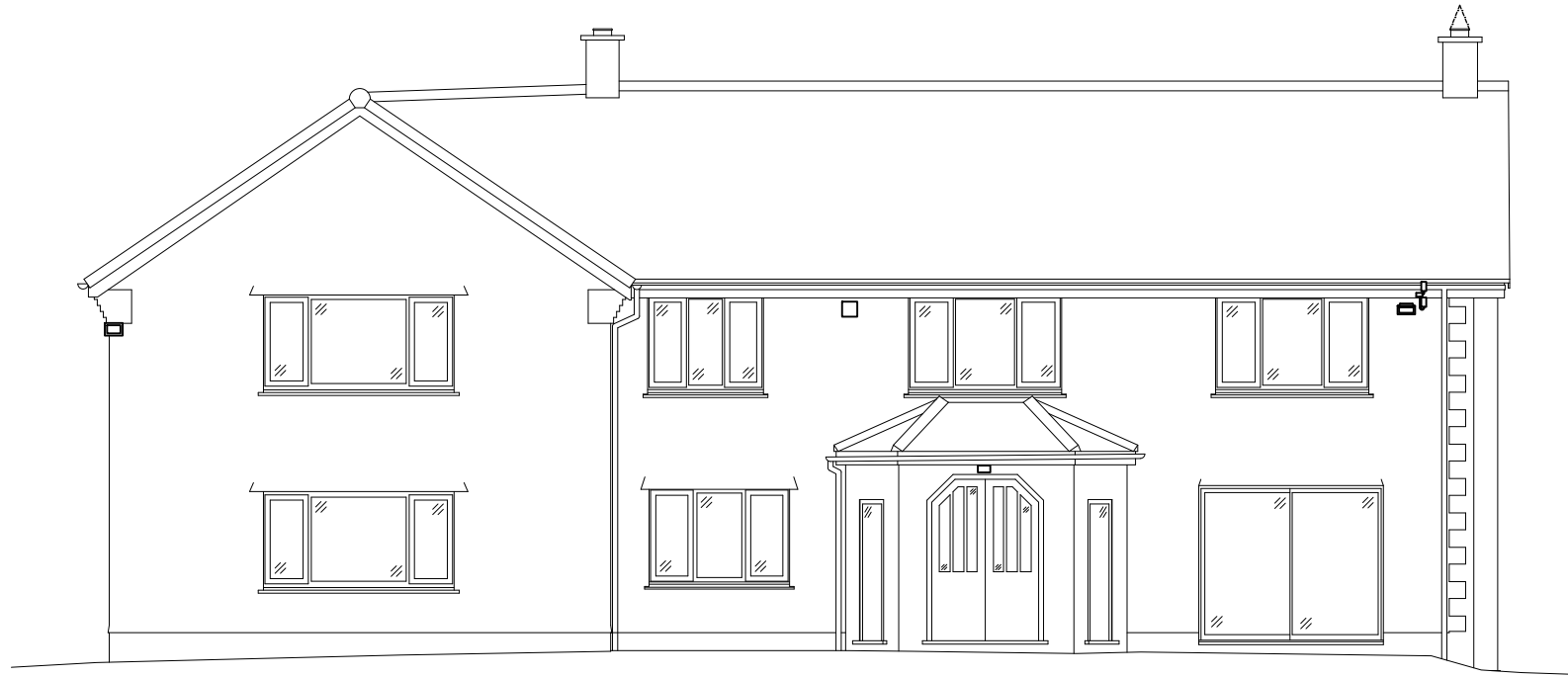
FRONT ELEVATION- NORTH

PROPOSAL SUBJECT TO: SITE SURVEY; STATUTORY APPROVALS; DESIGN DEVELOPMENT.