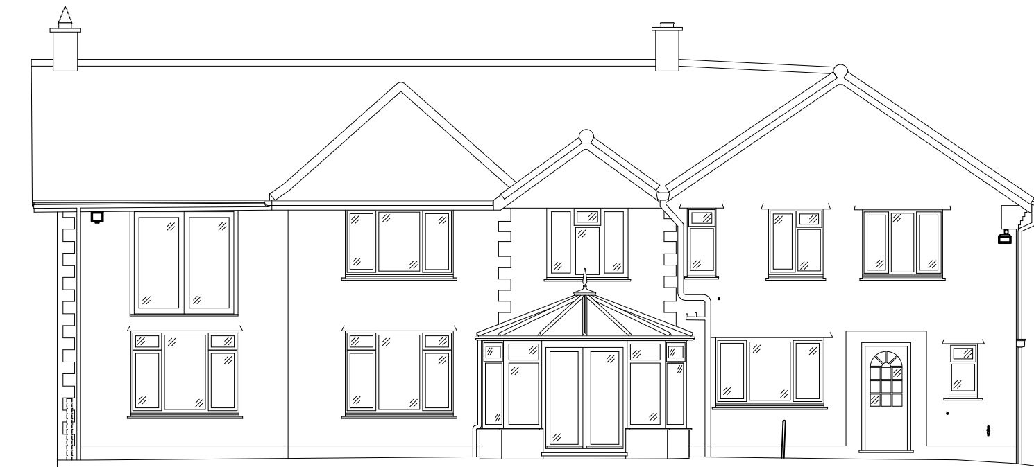
REAR ELEVATION- SOUTH