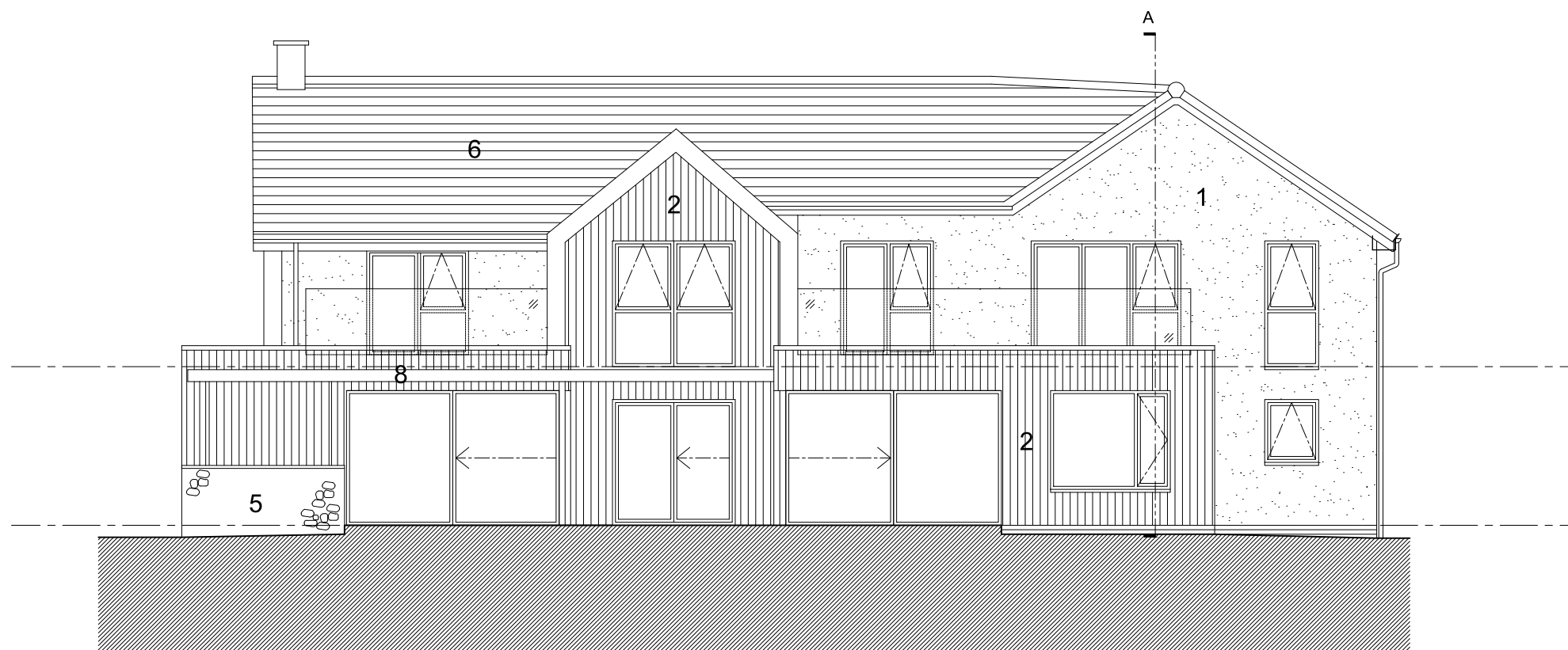
REAR ELEVATION- SOUTH

PROPOSAL SUBJECT TO: SITE SURVEY; STATUTORY APPROVALS; DESIGN DEVELOPMENT.