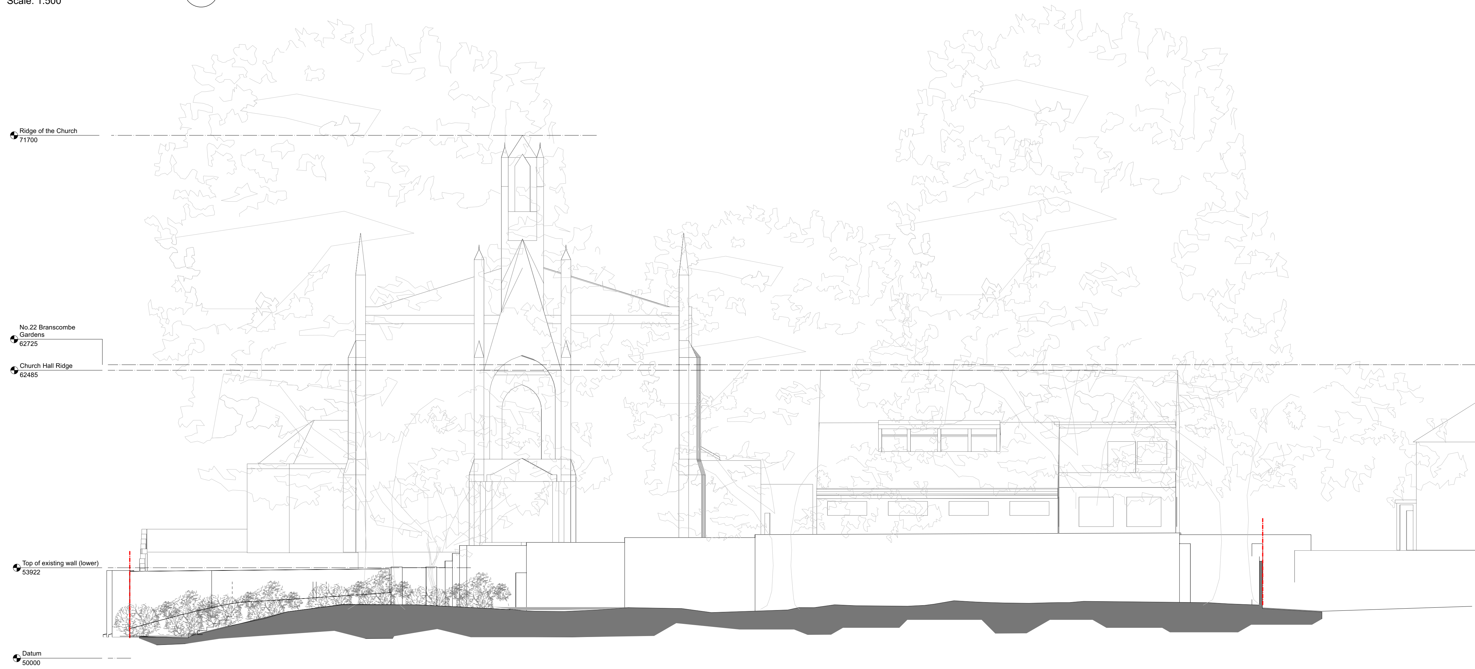
2 Existing Long Section Scale: 1:100

PROJECT 56a Church Hill CLIENT Gradica Building Contractors DRAWING TITLE Existing Sections