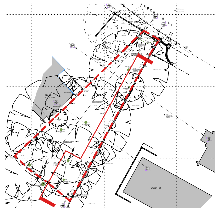
1 Key Plan Scale: 1:500