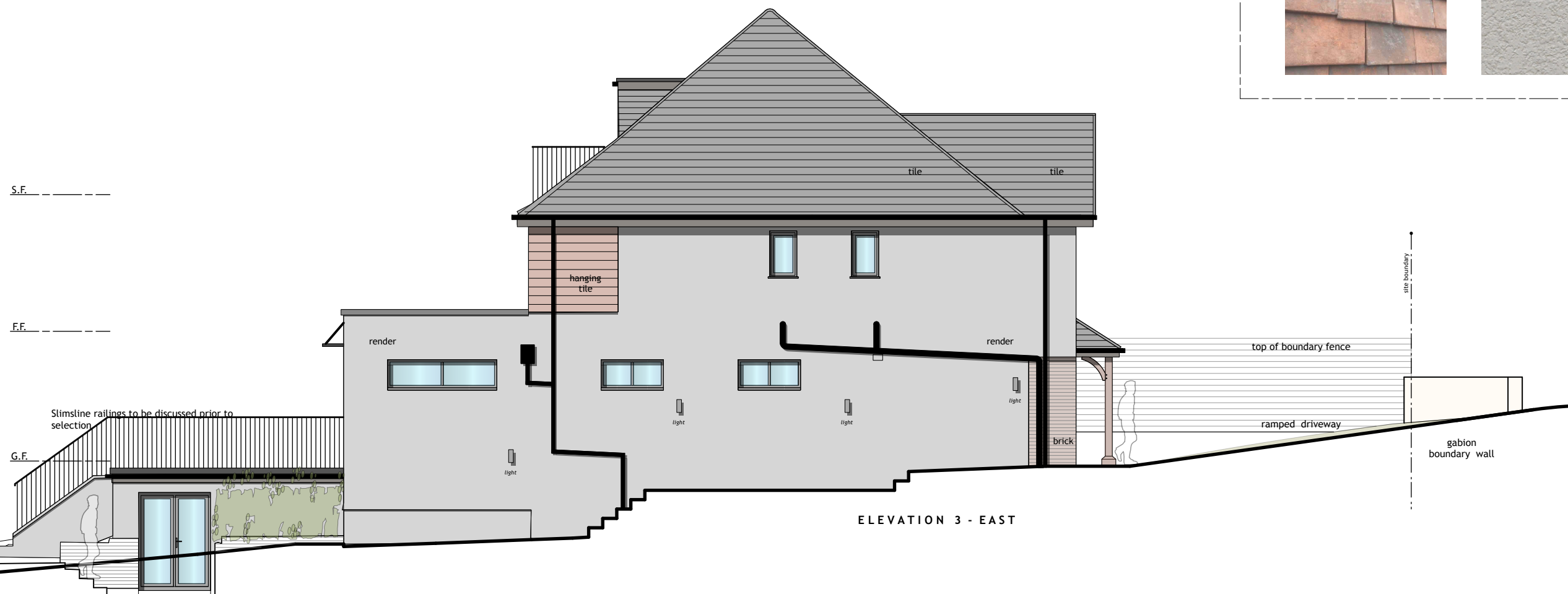
ELEVATION 3 - EAST