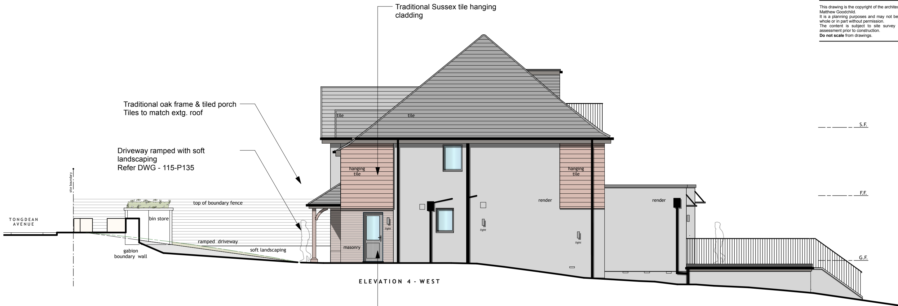
ELEVATION 4 - WEST

This drawing is the copyright of the architectural designer Matthew Goodchild. It is a planning purposes and may not be reproduced in whole or in part without permission. The content is subject to site survey and H&S risk assessment prior to construction. Do not scale from drawings.