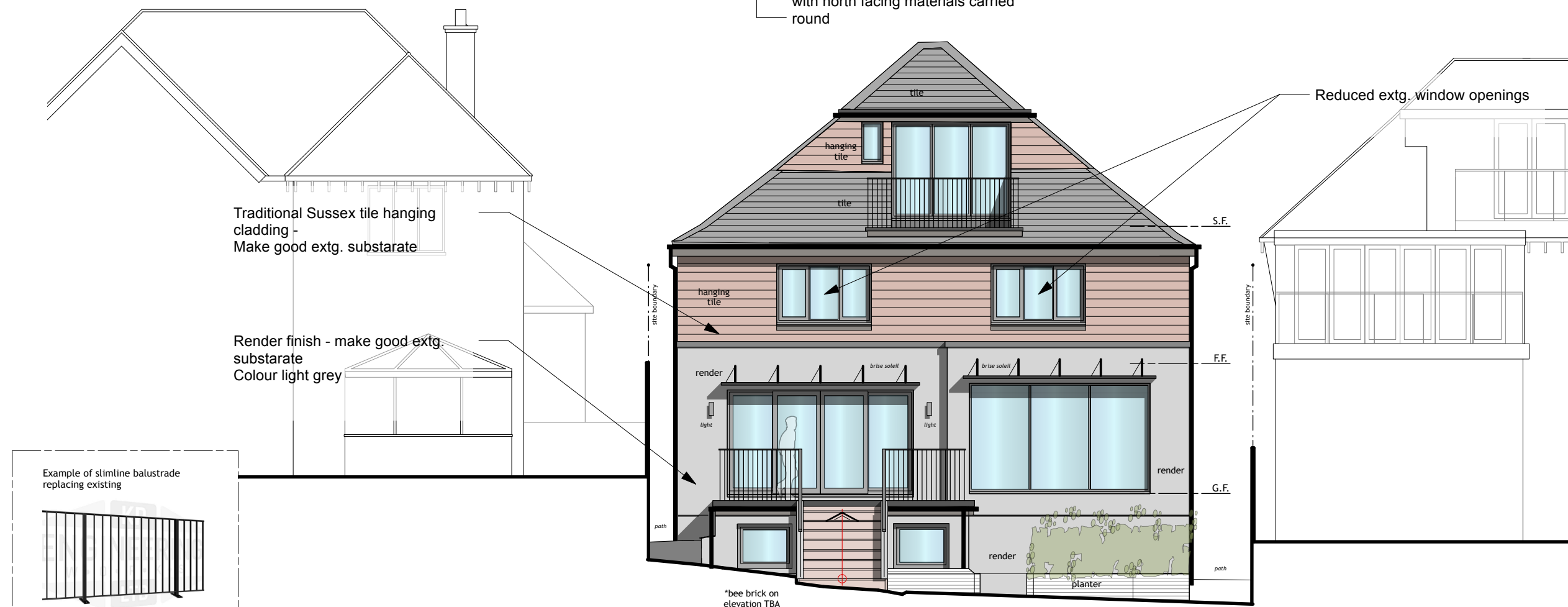
ELEVATION 2 - REAR

Timber framed door to boot room with north facing materials carried round