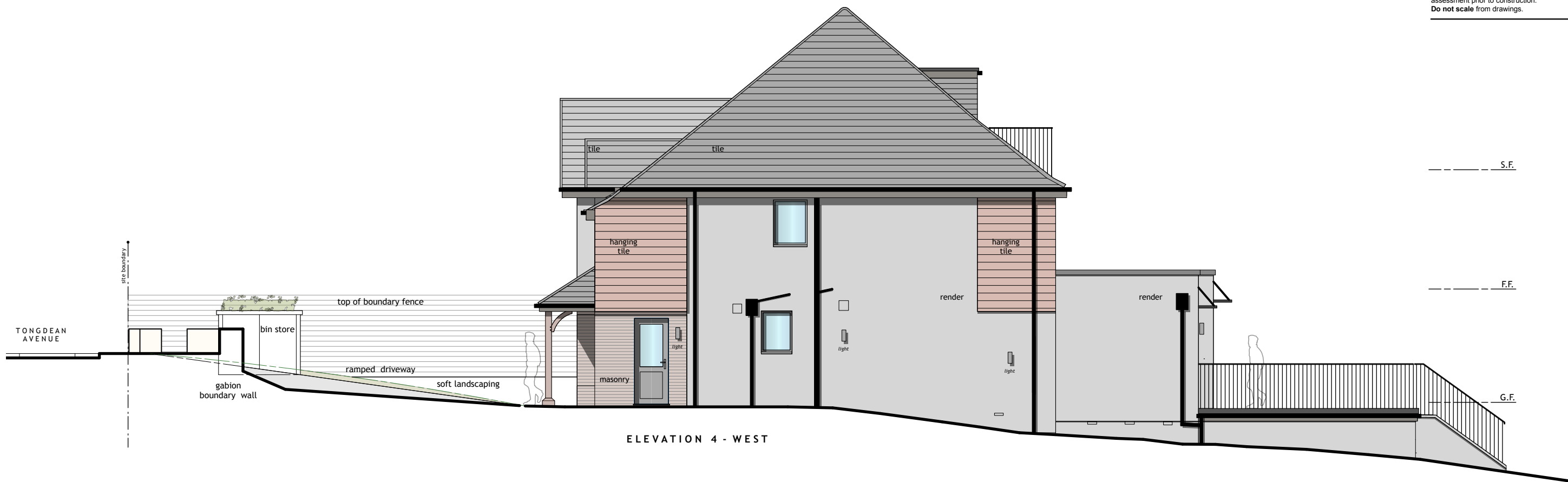
ELEVATION 4 - WEST

This drawing is the copyright of the architectural designer Matthew Goodchild. It is a planning purposes and may not be reproduced in whole or in part without permission. The content is subject to site survey and H&S risk assessment prior to construction. Do not scale from drawings.