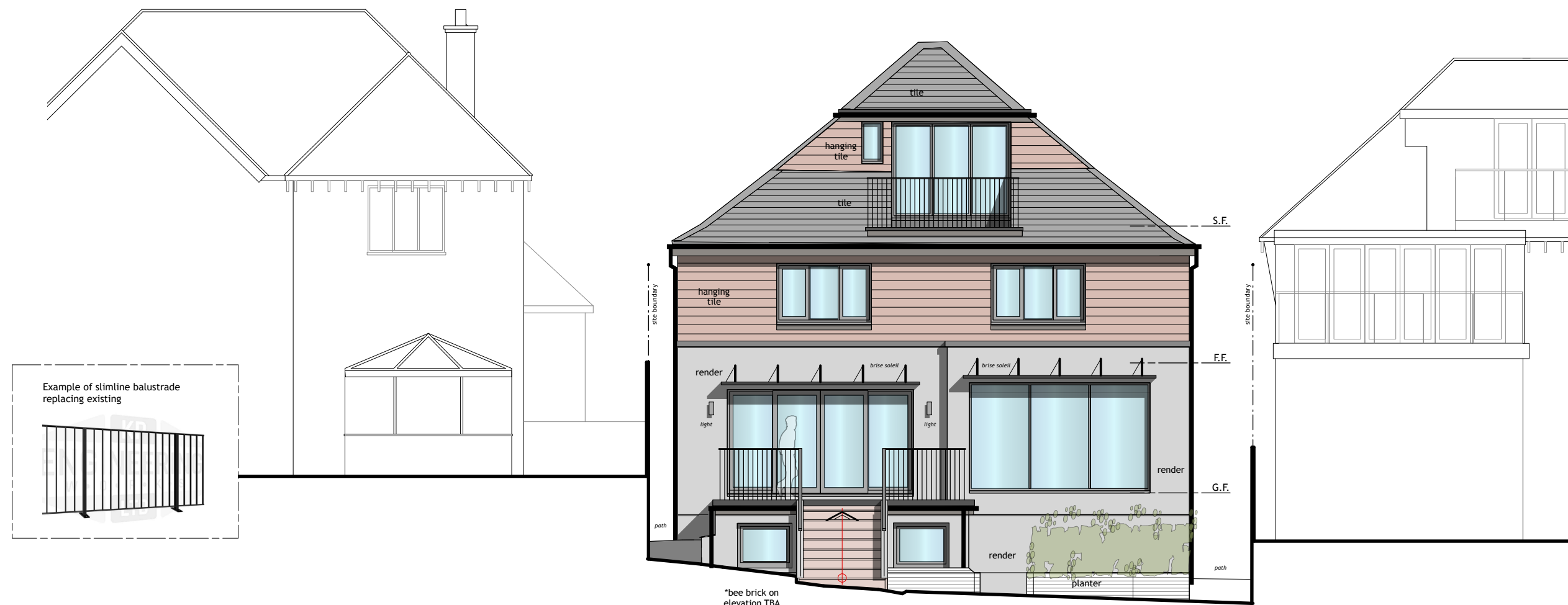
ELEVATION 2 - REAR