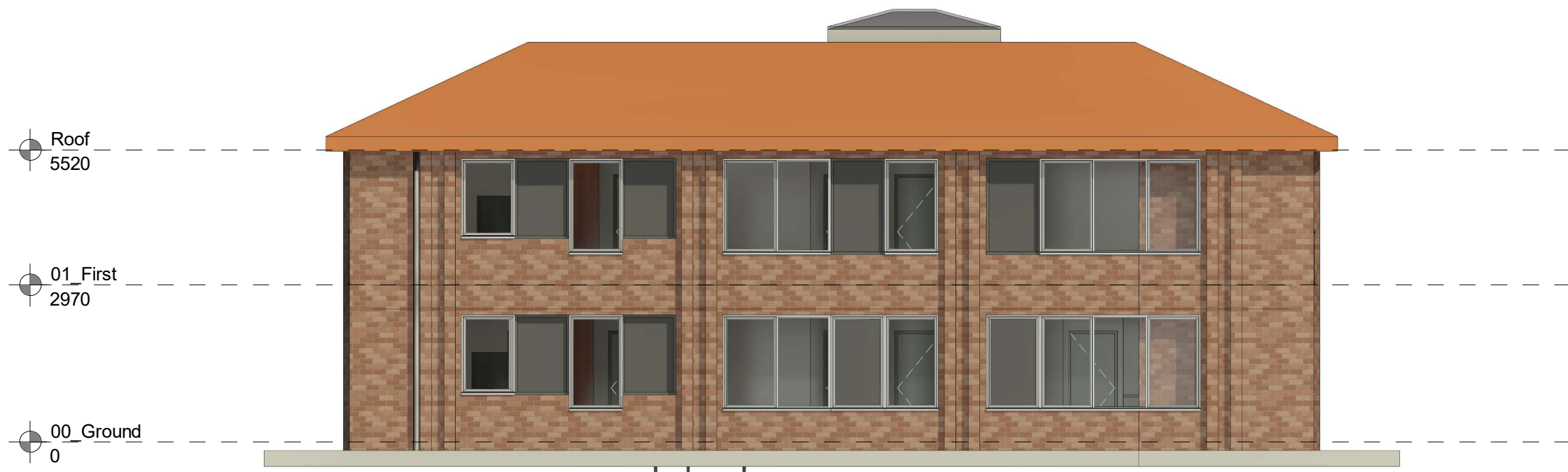
1 North OCE201 Scale - 1 : 100