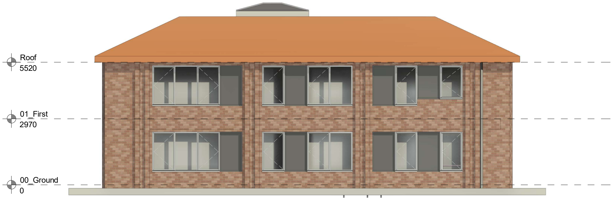
2 South OCE201 Scale - 1 : 100