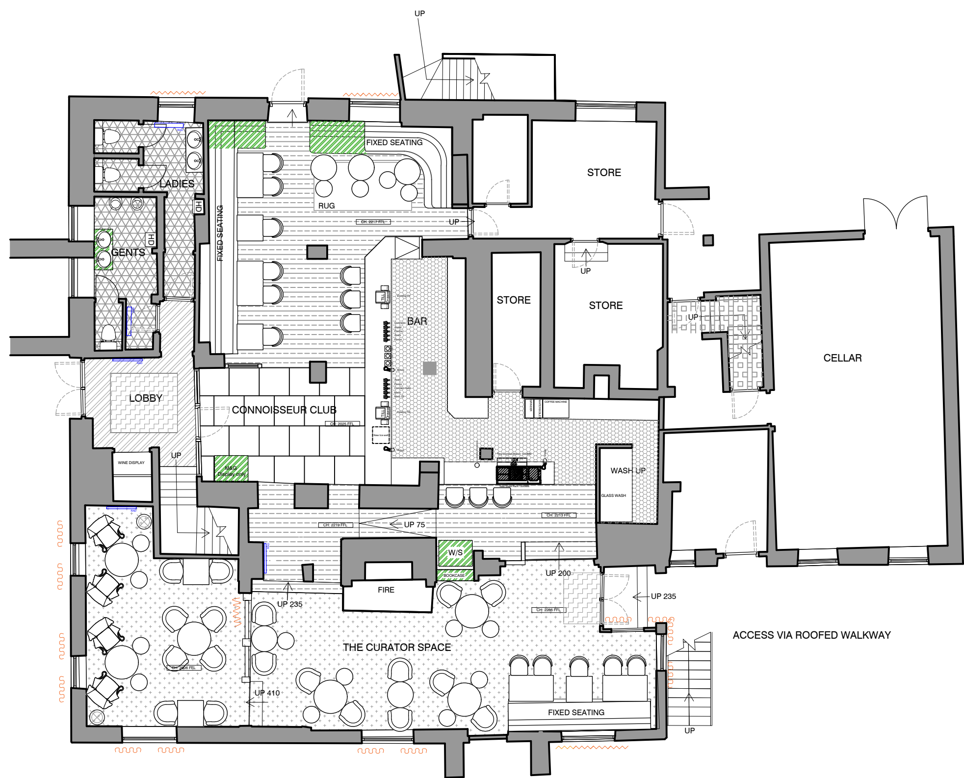
PROPOSED GF PLAN Scale: 1:100 @ A1