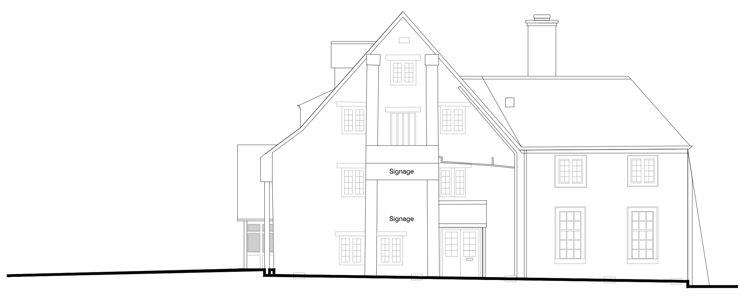
Existing Front Elevation (West)