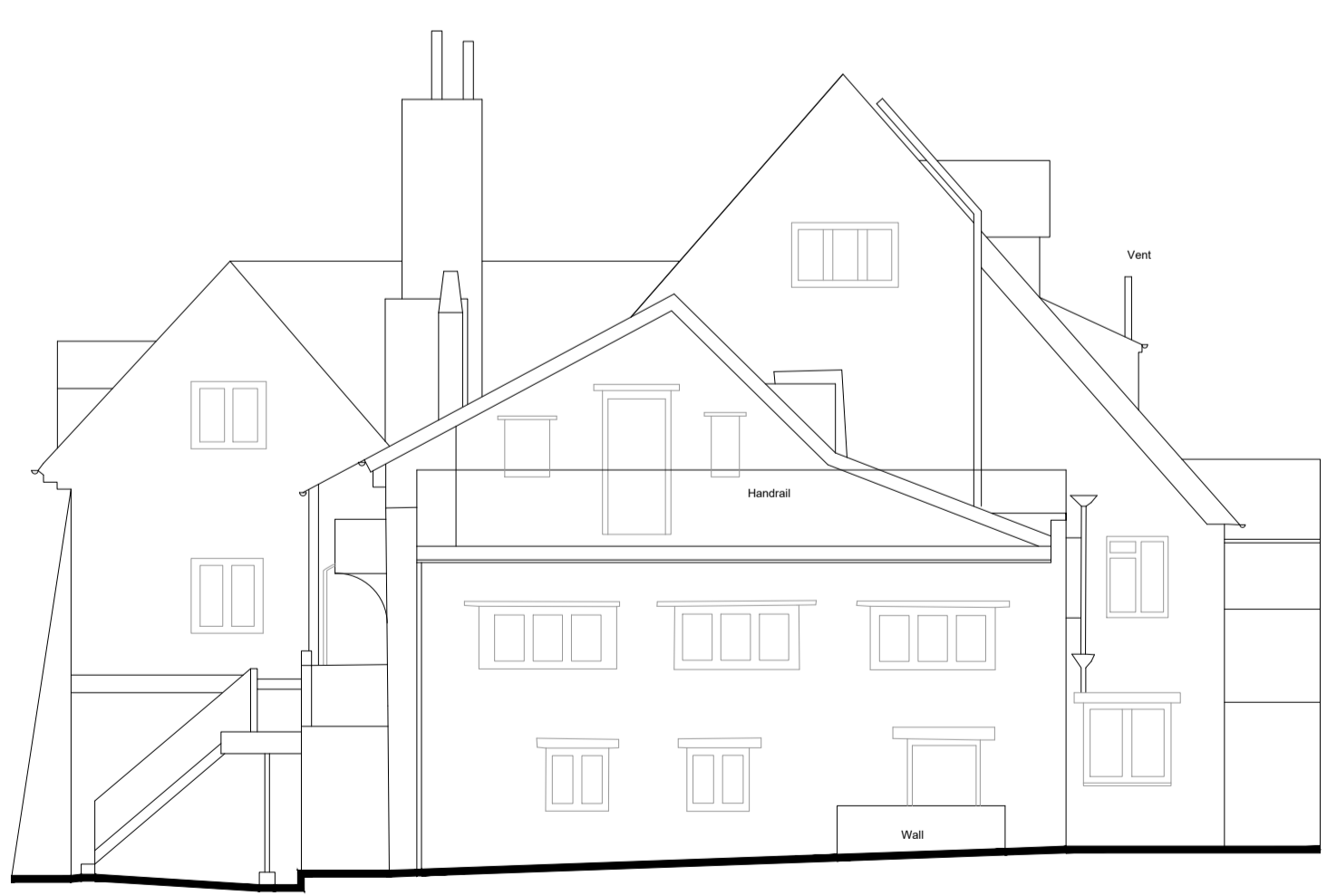
Existing Rear Elevation (East)