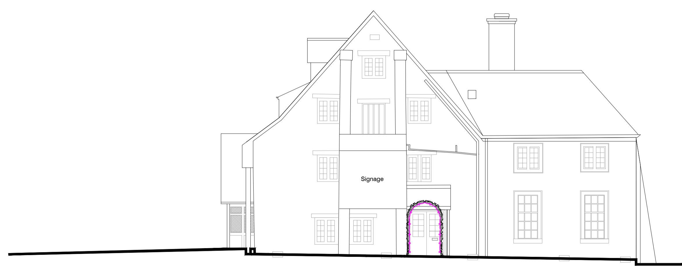
Proposed Front Elevation (West)

10 ARCHES AT EQUAL DISTANCES POSITIONED ALONG ENTRANCE. EACH ARCH IS TO BE A METAL POWDER COATED FINISH AND CONSIST OF 20 LARCHES APPROX. 300MM APART WITH HORIZONTAL ROPE IN BETWEEN TO CONNECT THEM FOR THE PLANTS TO GROW UP. THREE PLANTERS BETWEEN ARCHES AS SHOWN.