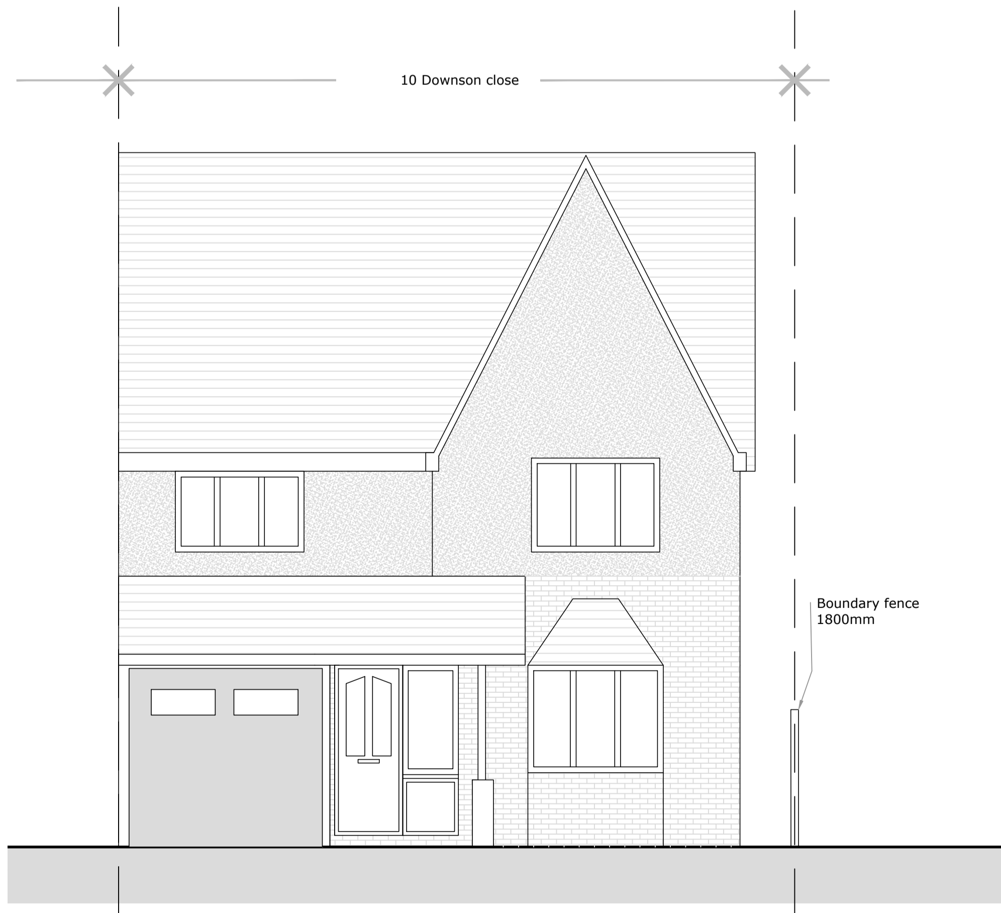
West Elevation as EXISTING 1:50