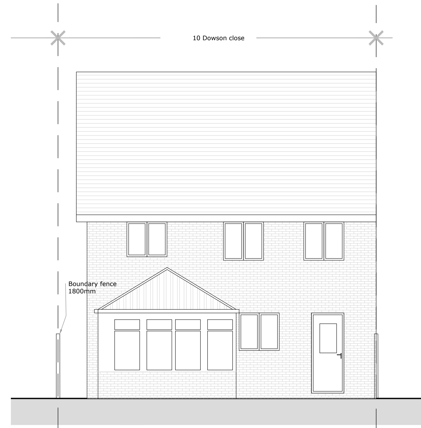
South Elevation as EXISTING 1:50