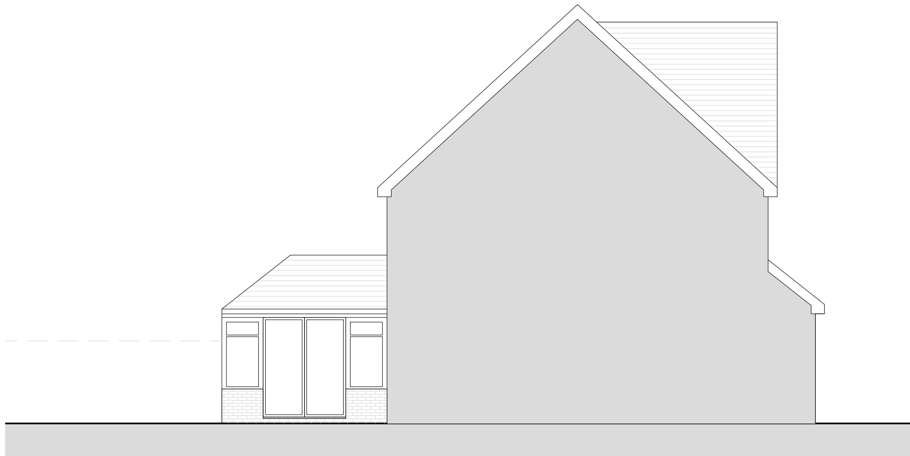
East Elevation as EXISTING 1:50