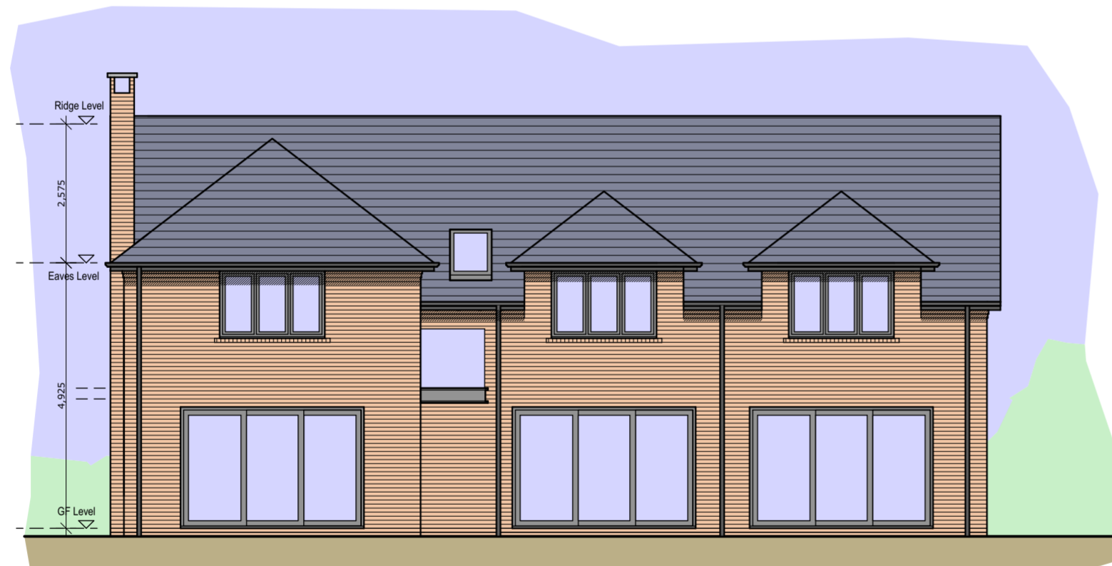
Rear Elevation Scale 1:100