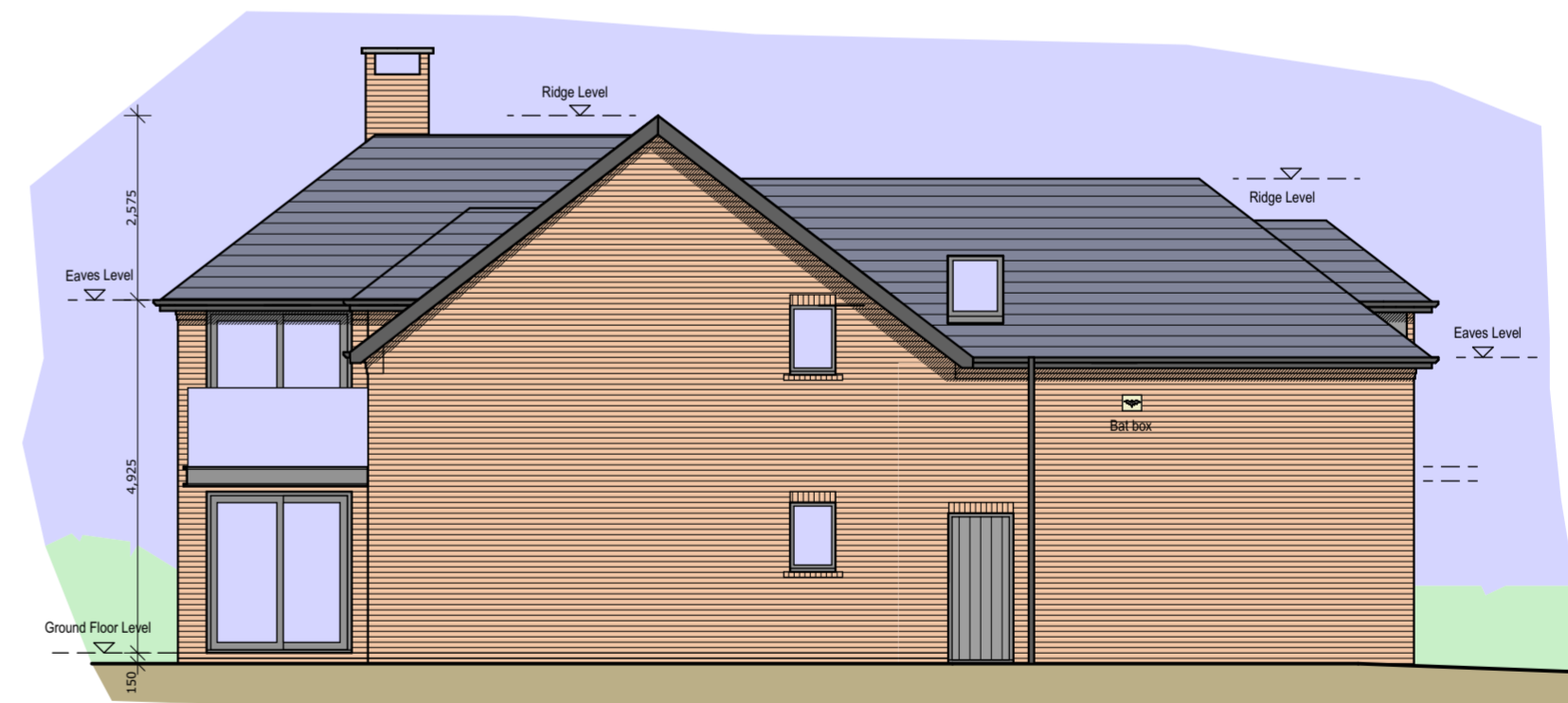
Side Elevation Scale 1:100