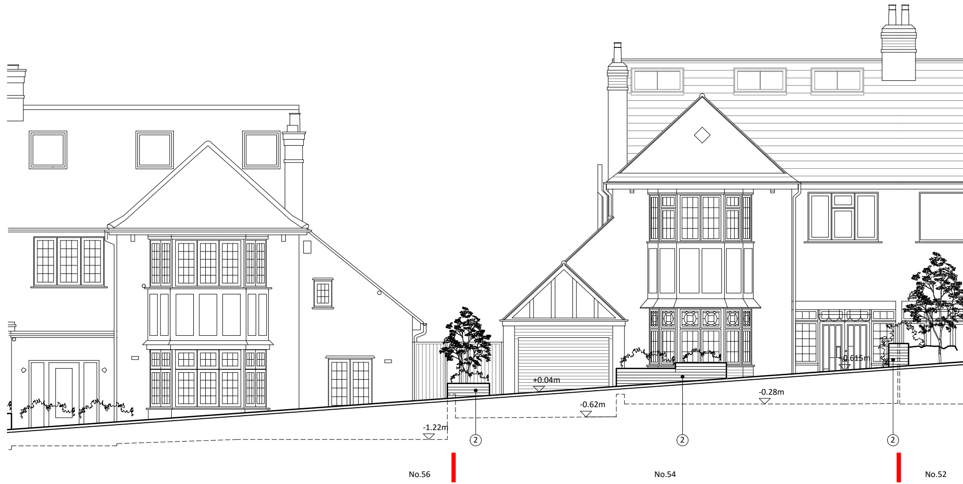
Existing Front Elevation (From Street)