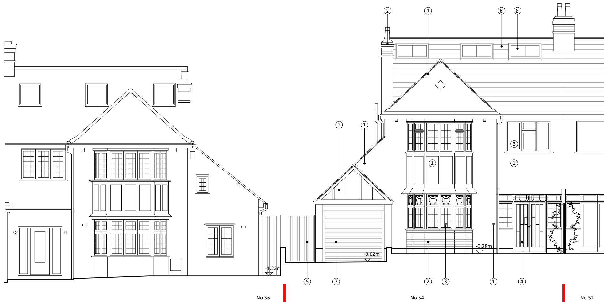
Existing Front Elevation (From Driveways)