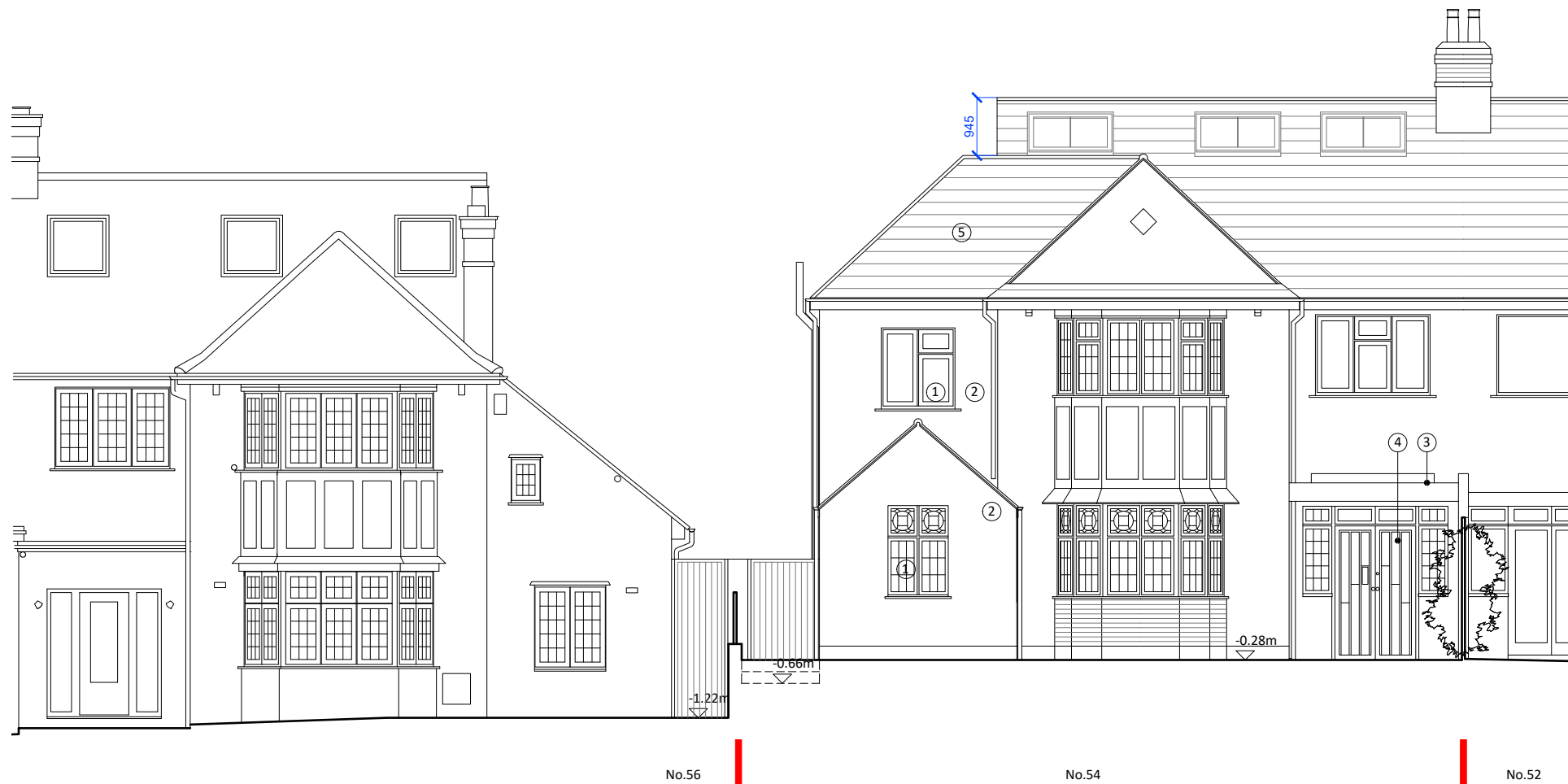
Proposed Front Elevation (From Driveways)