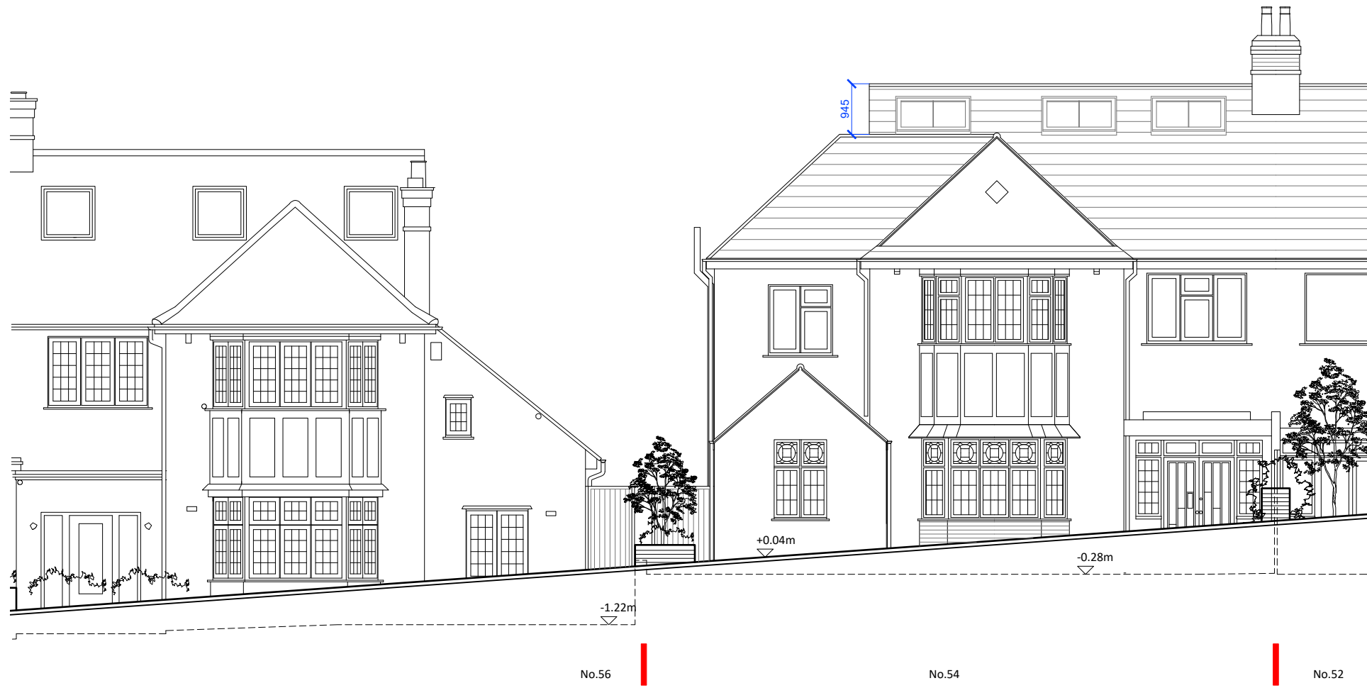
Proposed Front Elevation (From Street)