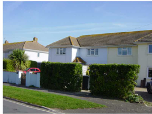
Front view - Howard Ave