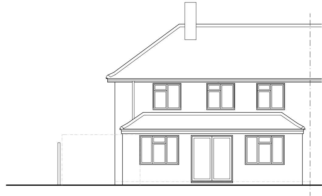
East Elevation | existing