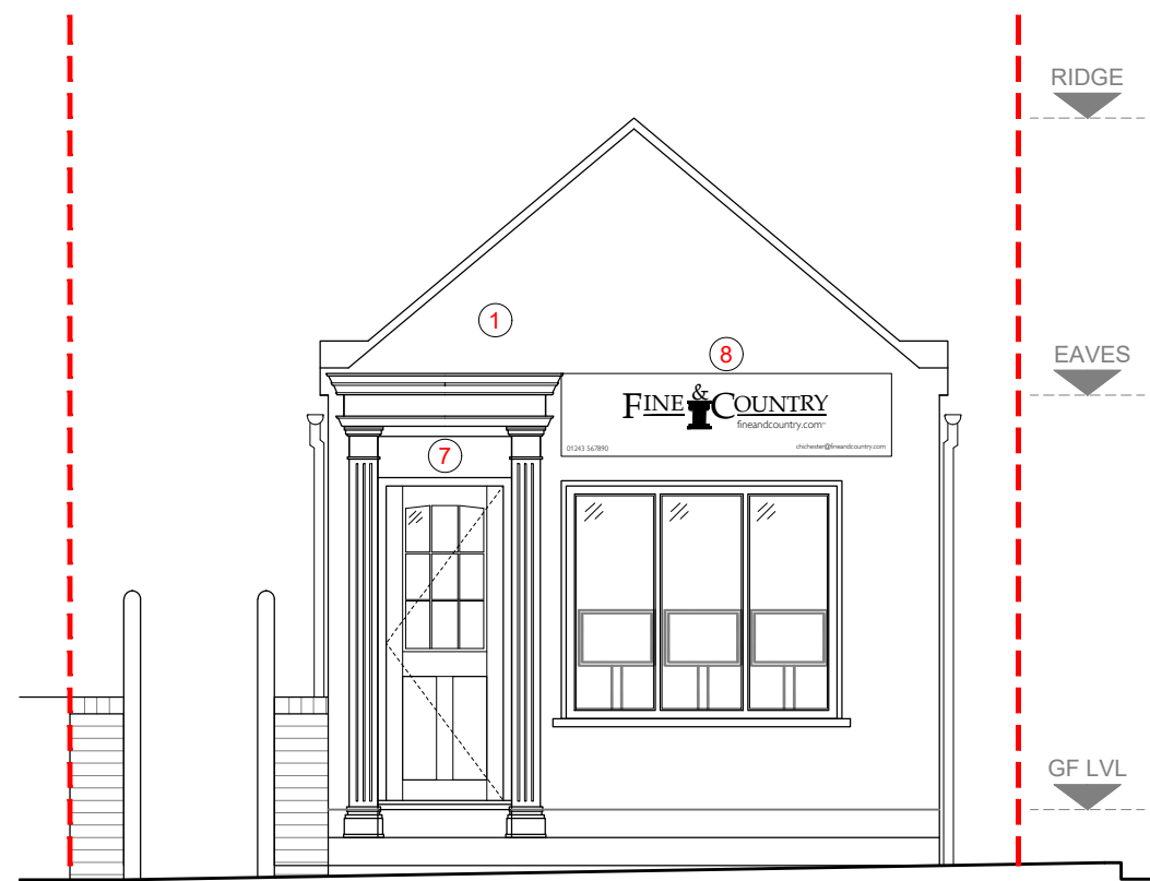
① SOUTH ELEVATION - AS PROPOSED Scale: 1:50