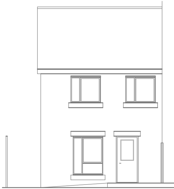
EXISTING (REAR) ELEVATION