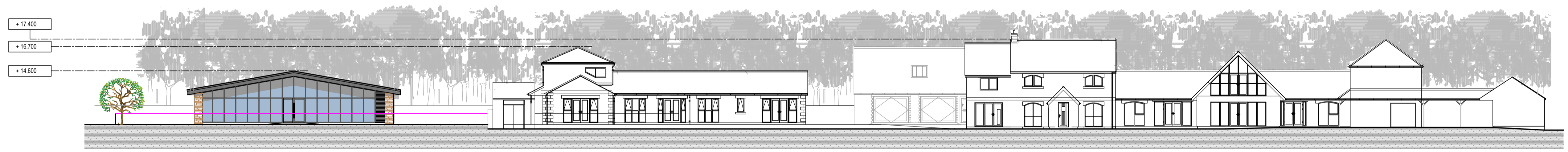
SITE WIDE ELEVATION (SOUTH EAST)