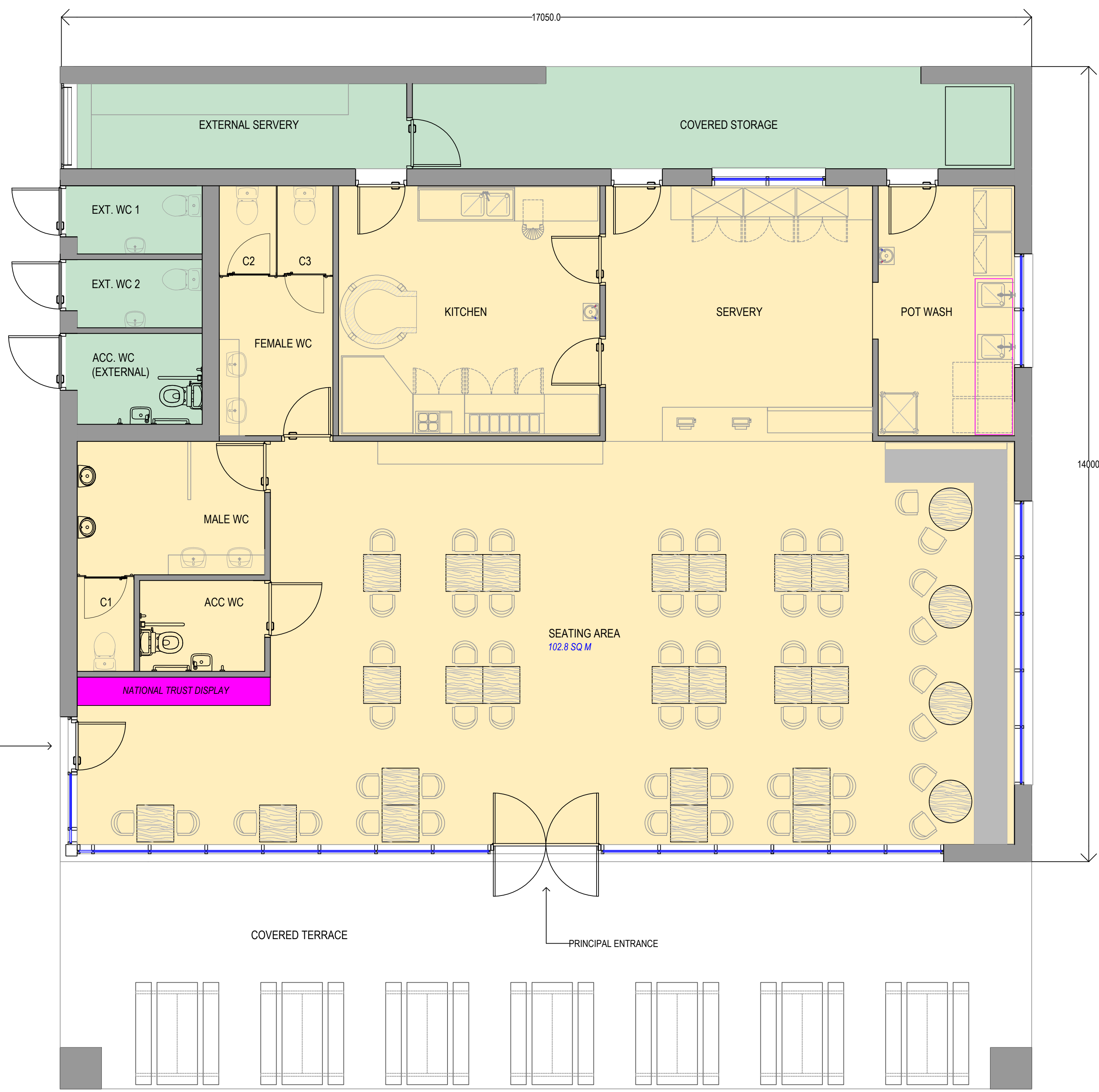
GA FLOOR PLAN