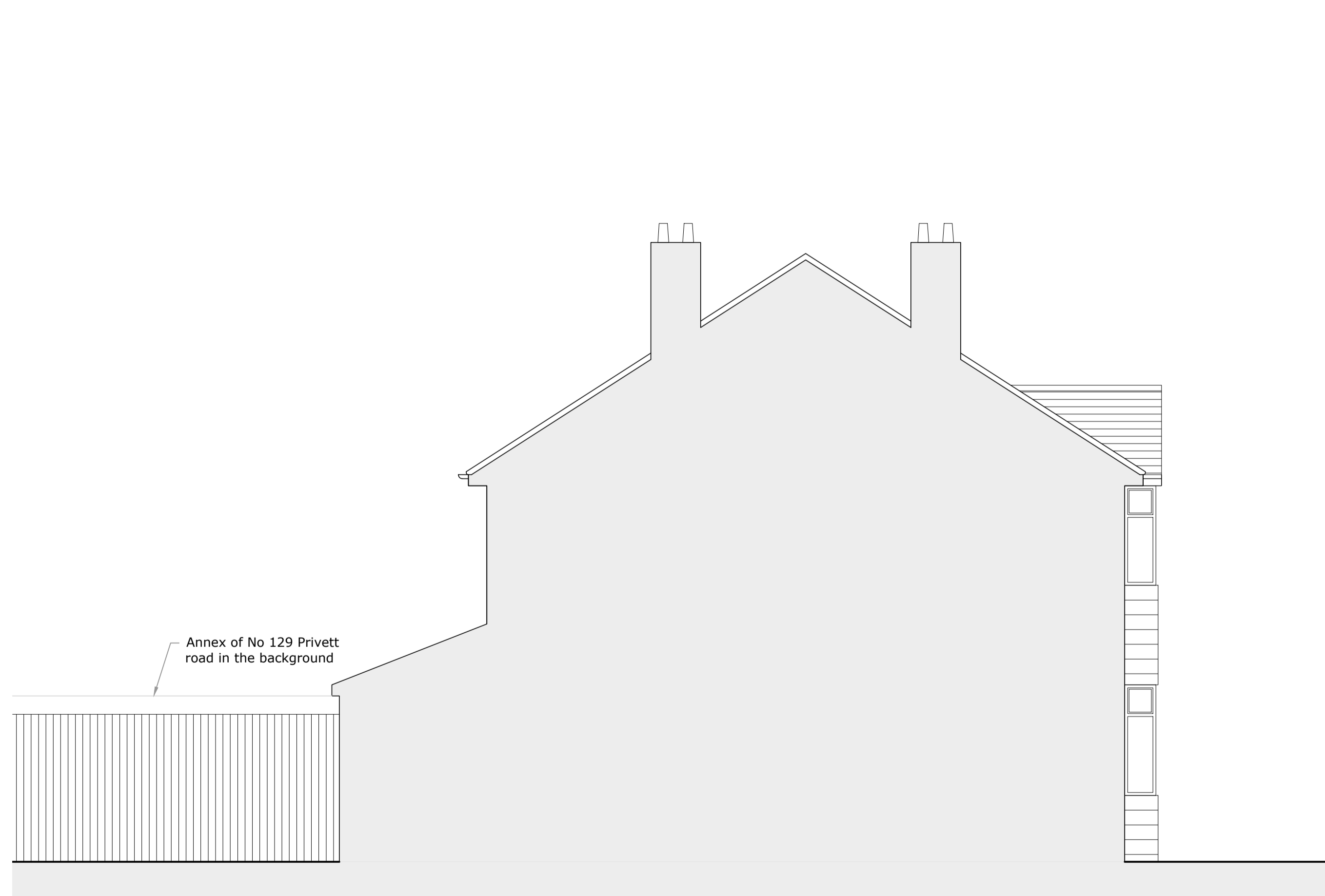
side elevation (east facing) as proposed 1:50