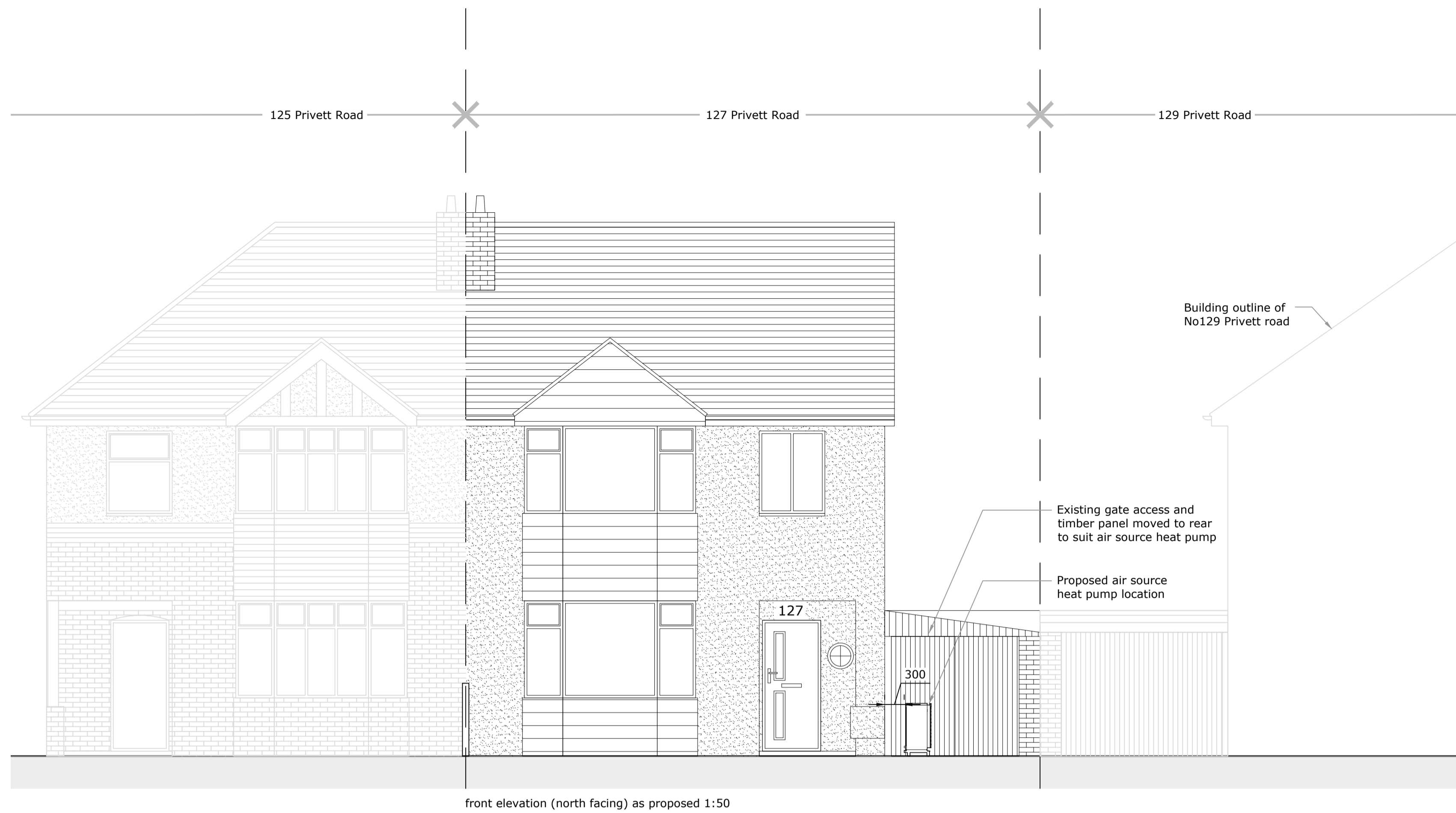
front elevation (north facing) as proposed 1:50