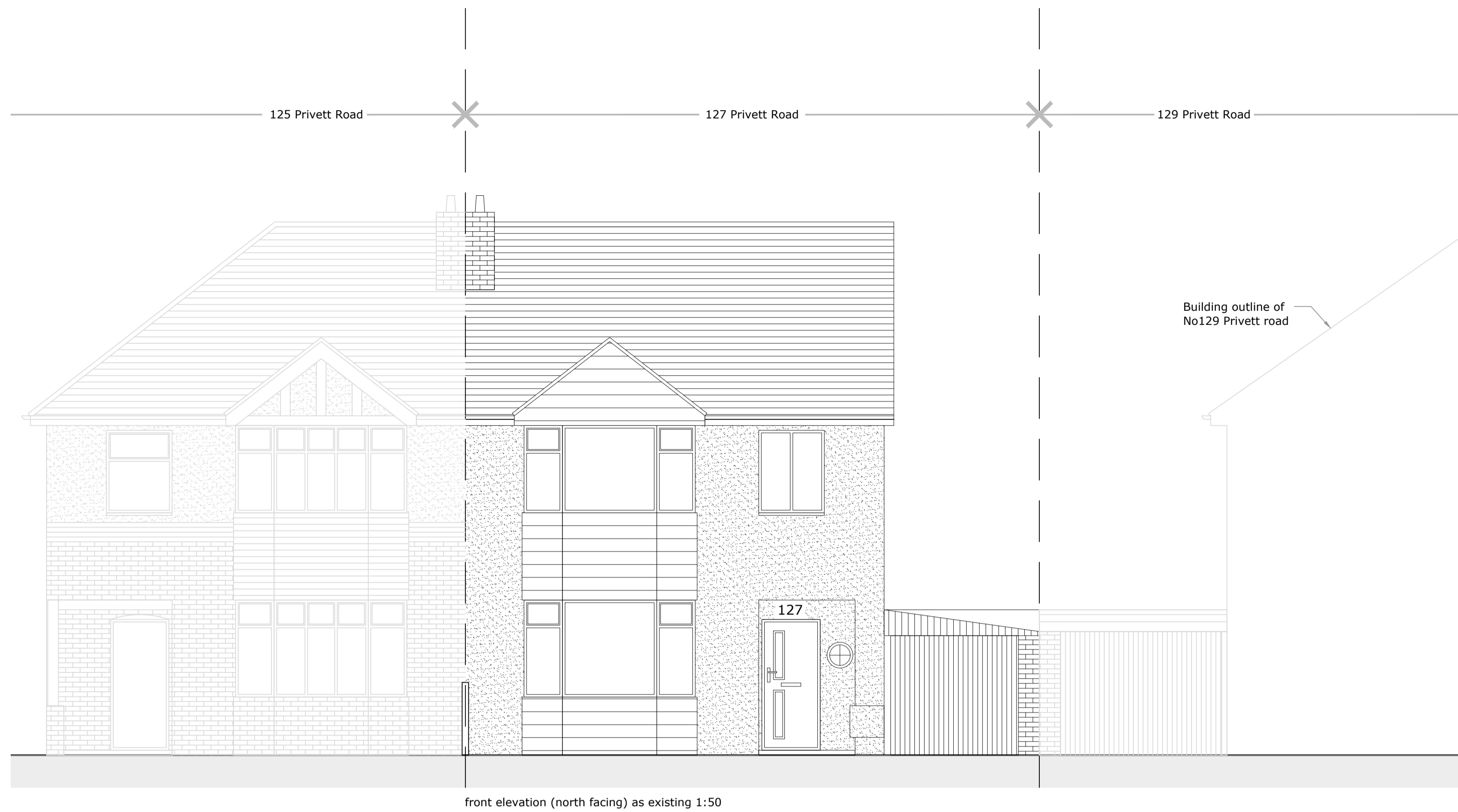
front elevation (north facing) as existing 1:50