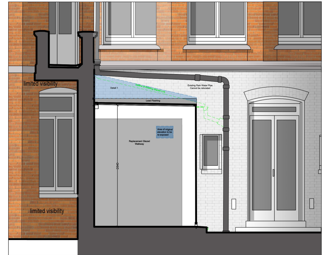
Proposed Section B-B