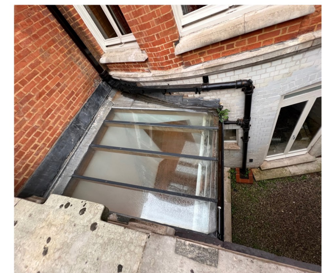
Existing Situation (Pitched Roof)