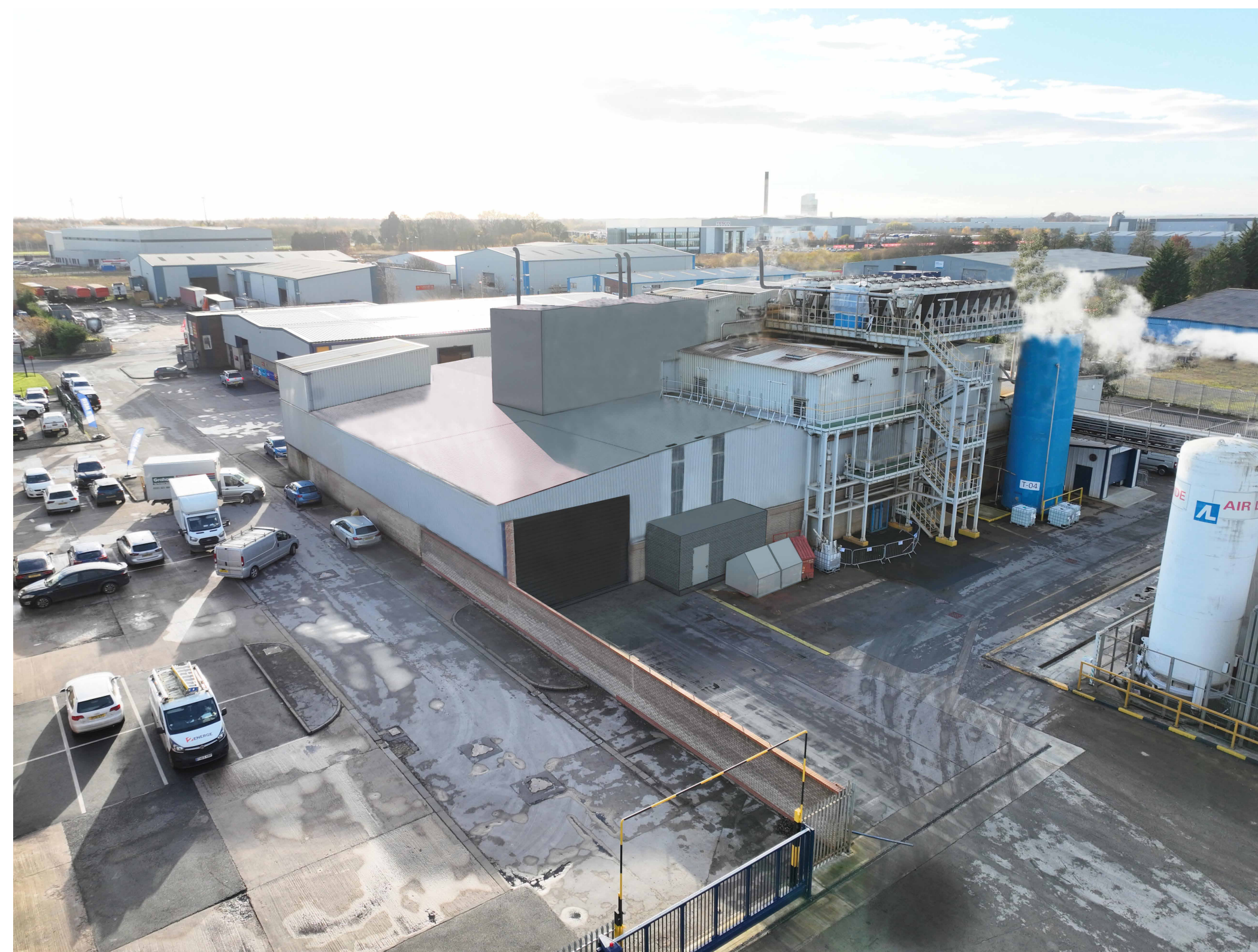
External view 3 - AFTER - Conveyor removed from image to show changes to building structure only