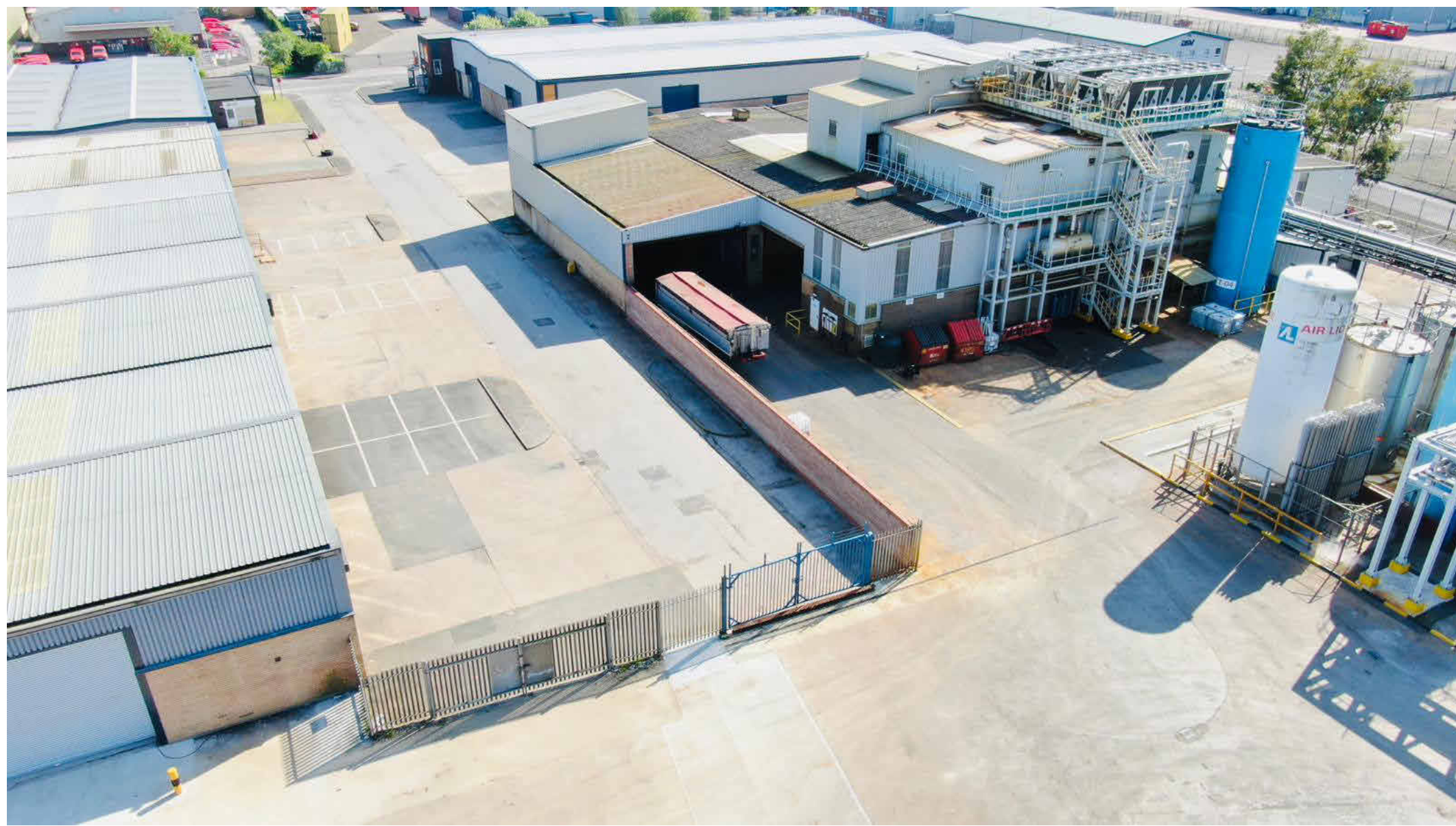
External view 2 - BEFORE