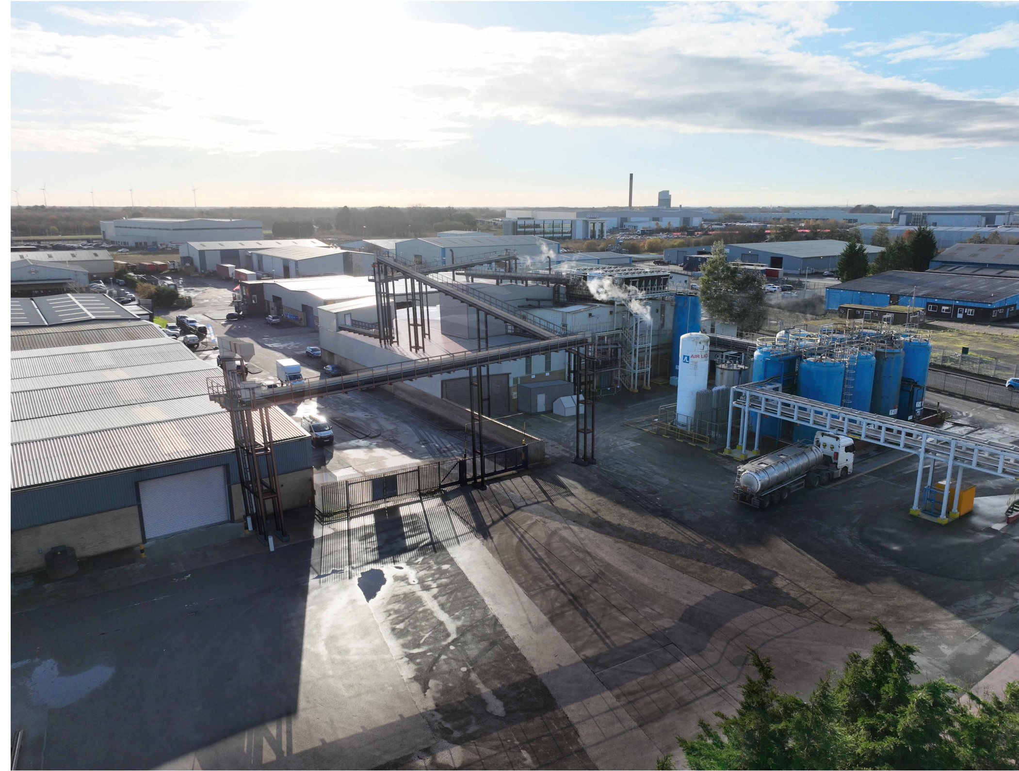
External view 1 - AFTER