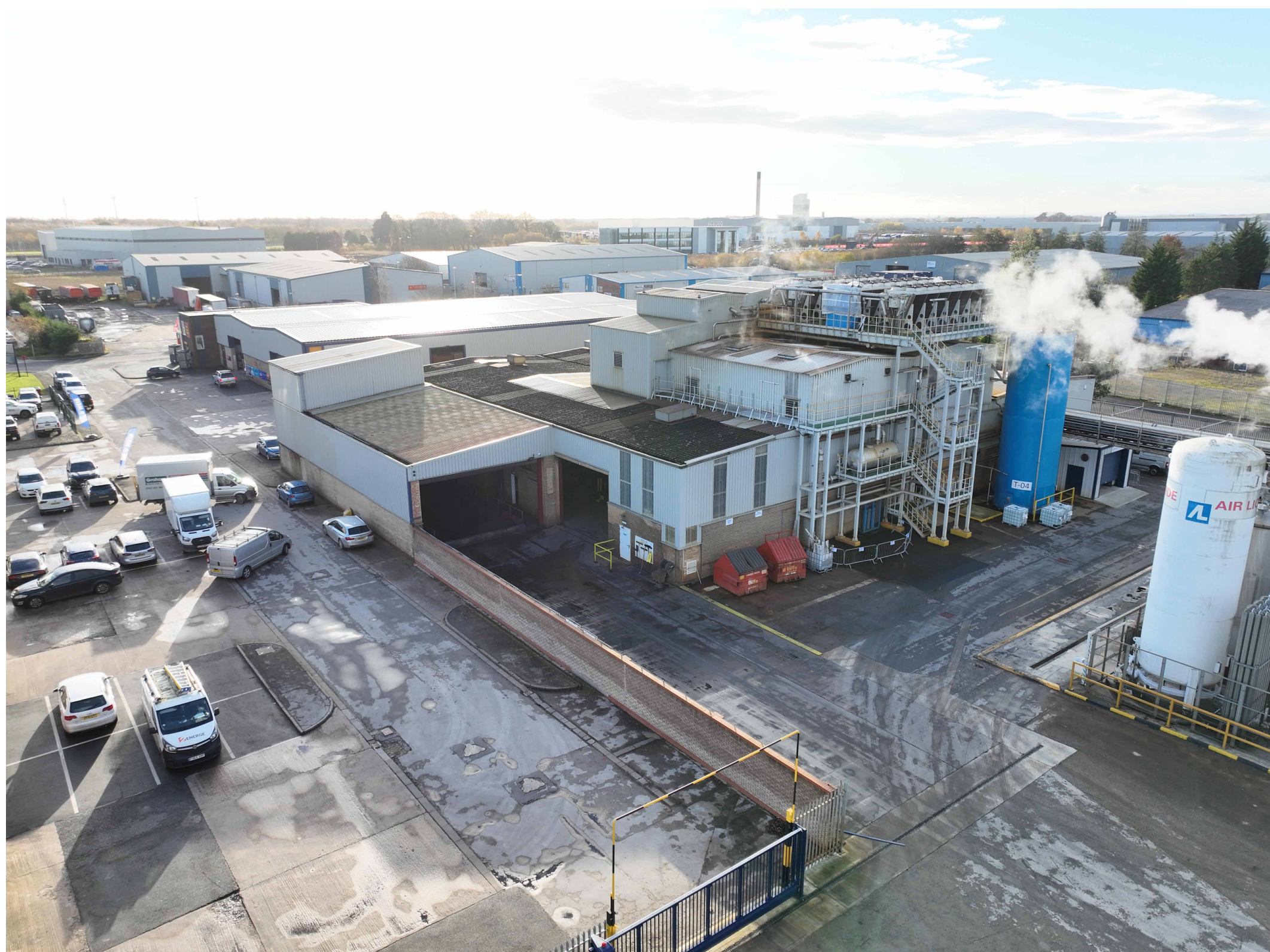
External view 3 - BEFORE