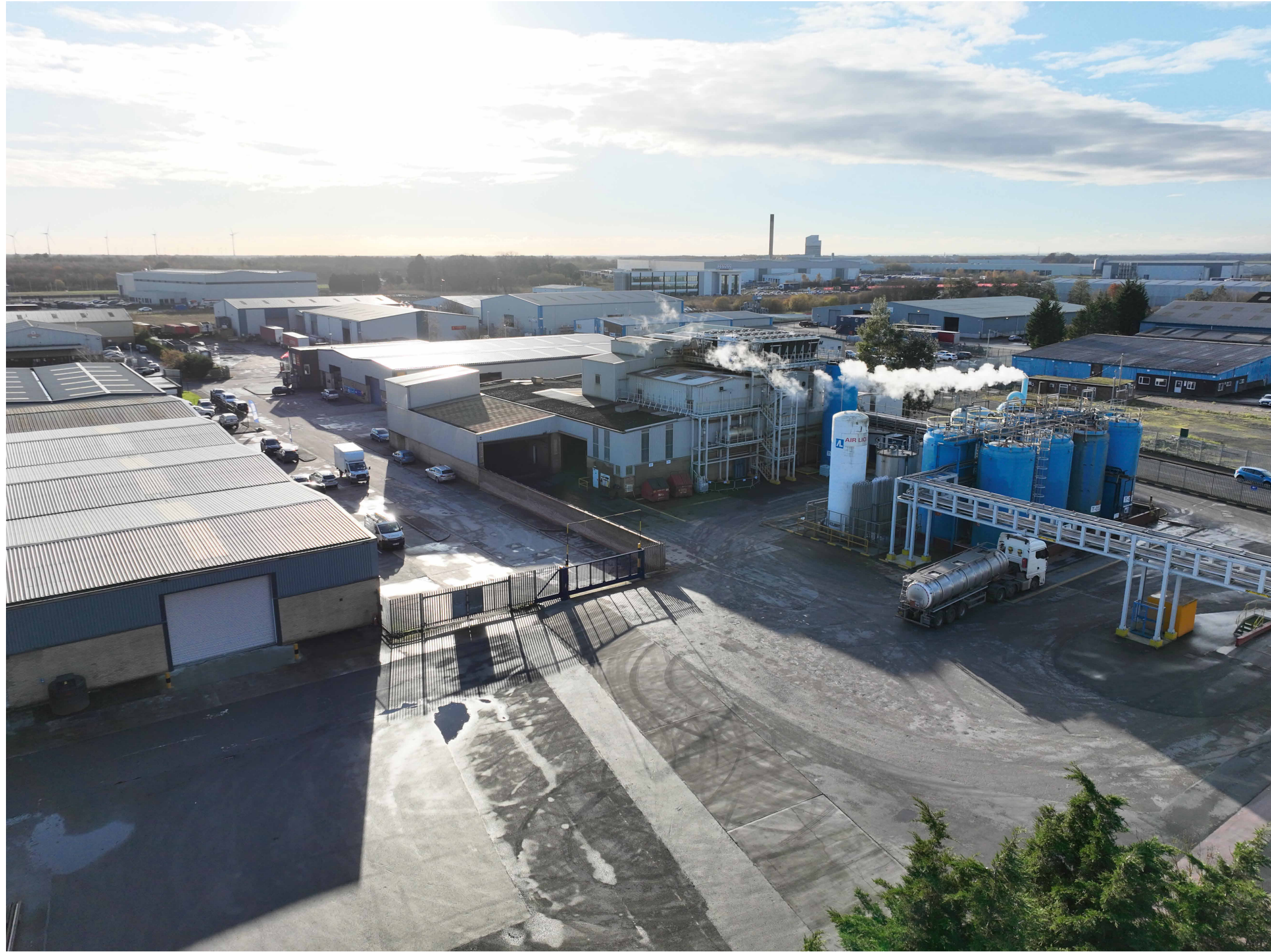
External view 1 - BEFORE