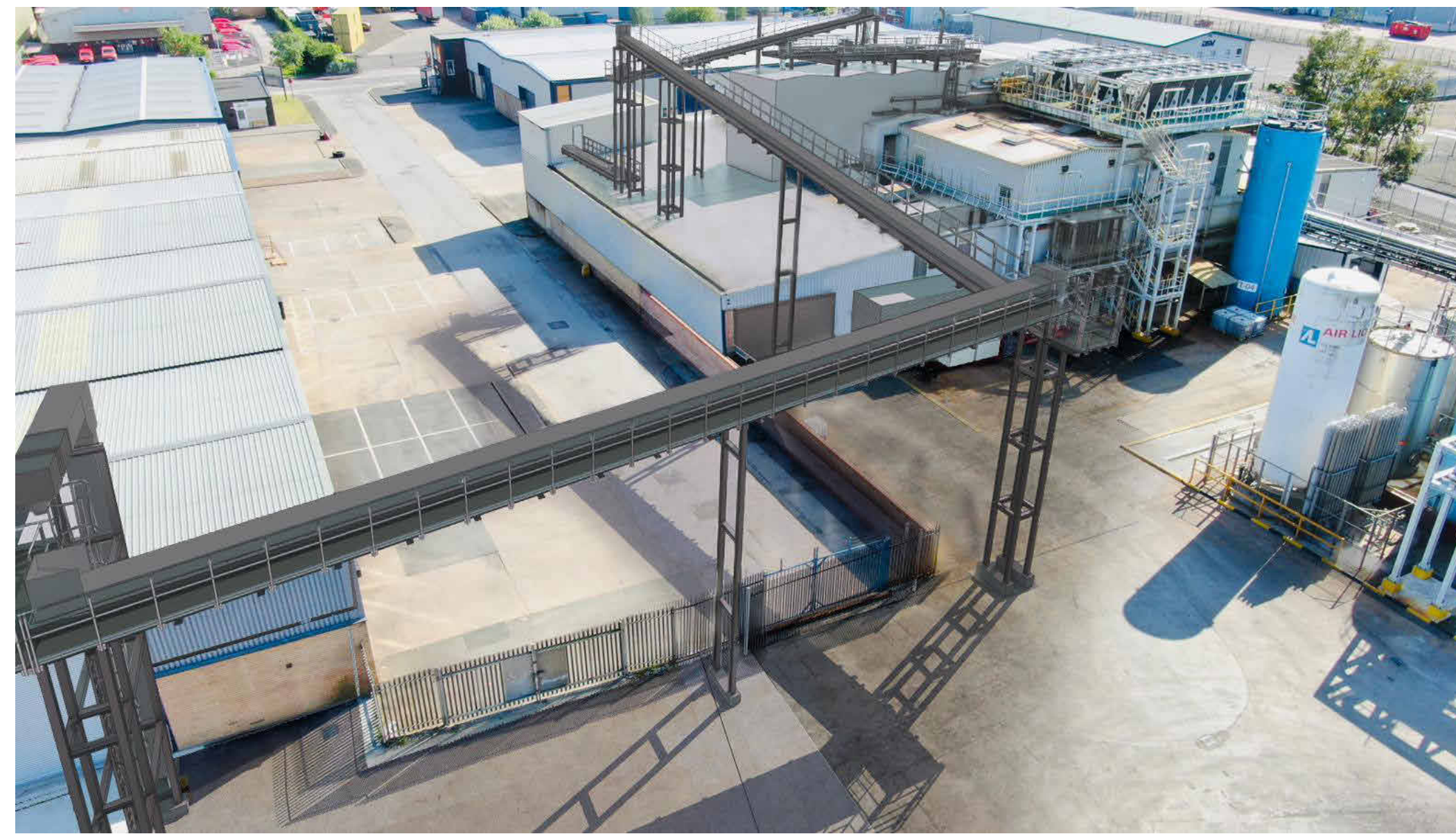
External view 2 - AFTER