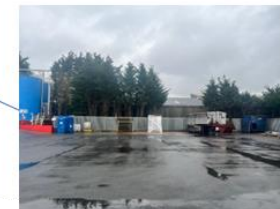
2.4m high Palisade Fence