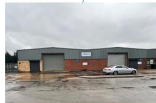
Industrial Unit Facade