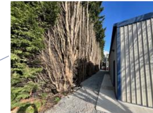
2.4m Chain-link Fence with Leylandii