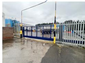
Emergency Access Gate