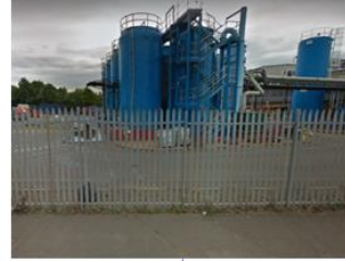
2.4m Palisade Fence