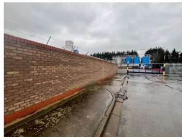
2.1m high Brick Wall